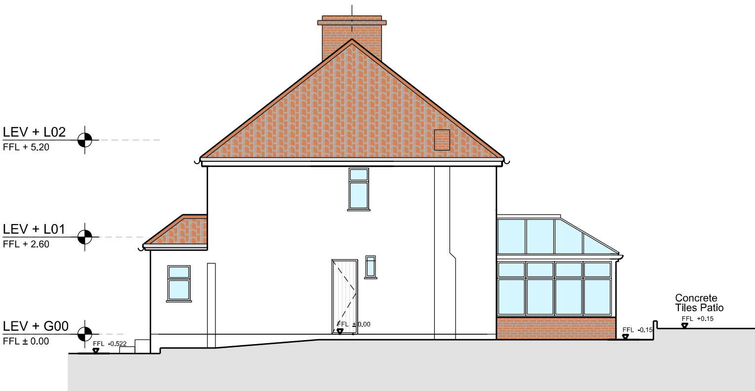
09 SIDE ELEVATION 1:100

Disclaimer: Do not scale from this drawing. Check all dimensions on site before fabrication or setting out. This document is copyright and may not be reproduced without permission of the owner.