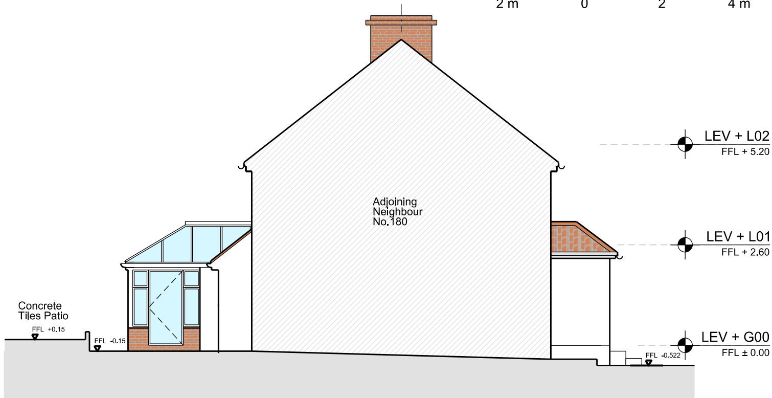
08 SIDE ELEVATION 1:100