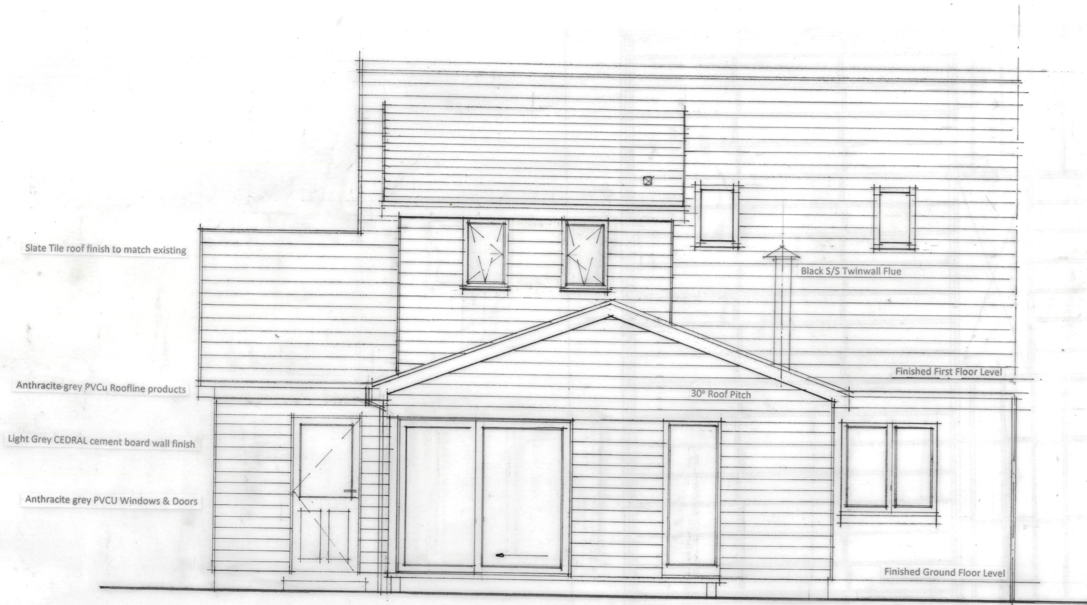
1:50 REAR ( SOUTH) ELEVATION AS PROPOSED