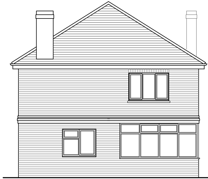
EXISTING RHS ELEVATION