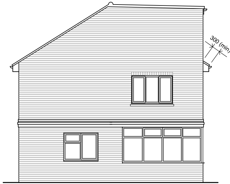
PROPOSED RHS ELEVATION