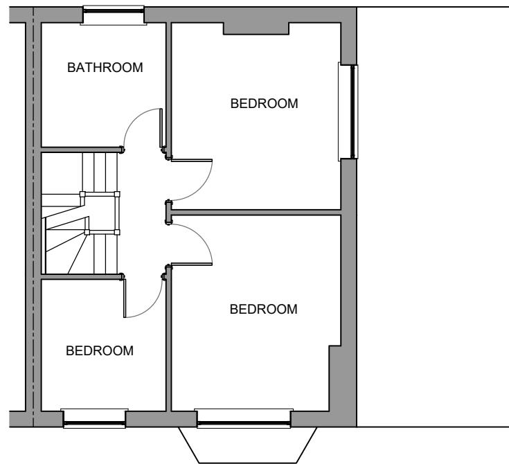
PROPOSED FIRST FLOOR LAYOUT