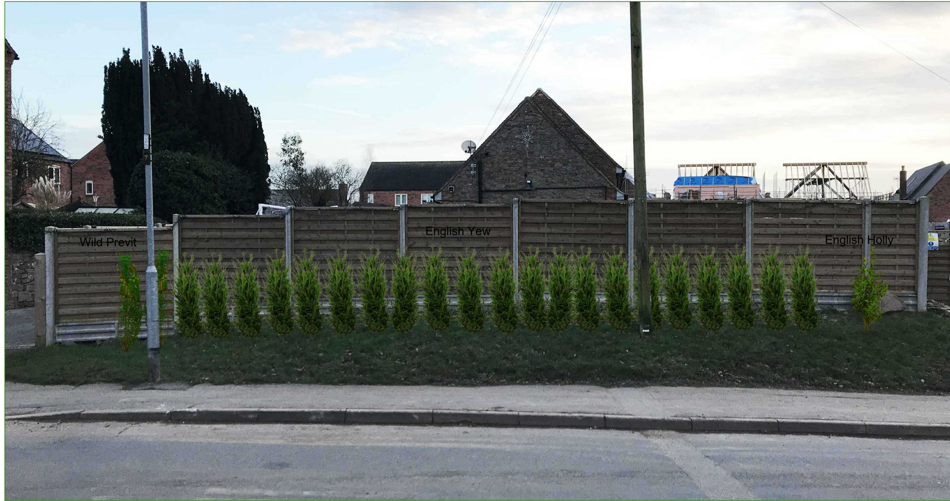
INITIAL PLANTING SCHEME