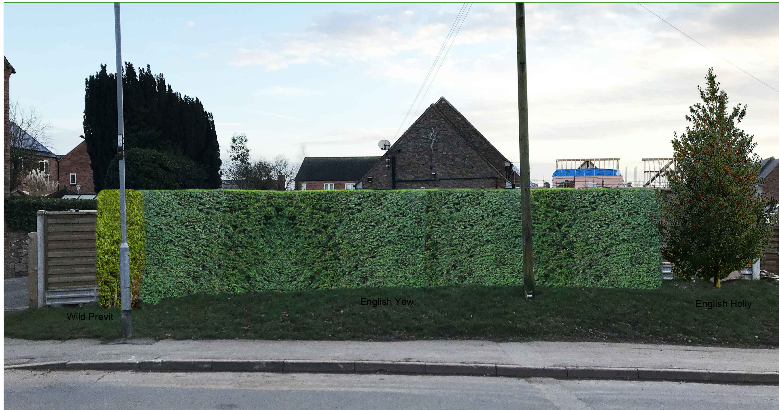
MATURE PLANTING SCHEME