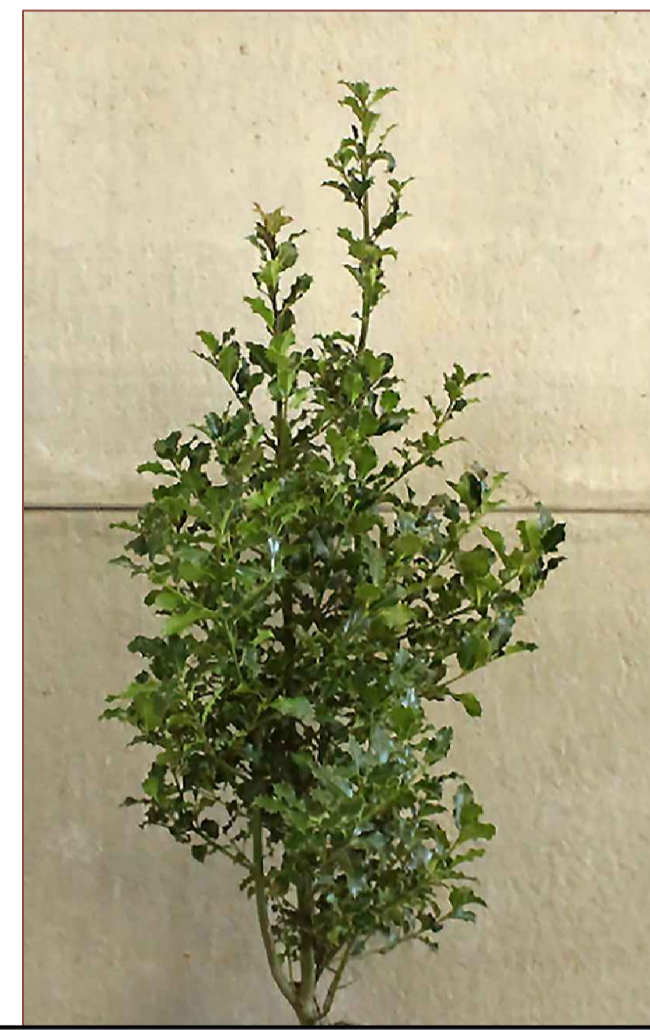
(ILEX AQUIFOLIUM) 1 NUMBER ENGLISH HOLLY 150CM ROOT BALL