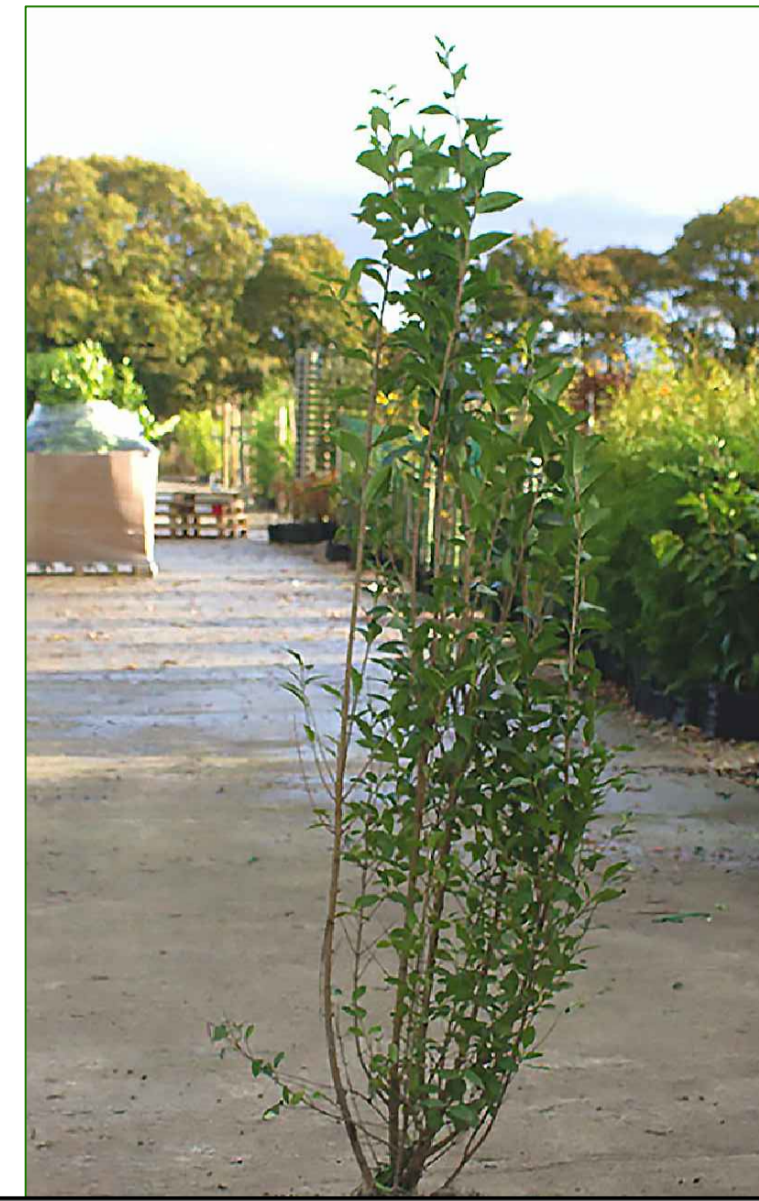
(LIGUSTRUM VULGARE) 2 NUMBER WILD PRIVET 175cm ROOT BALL