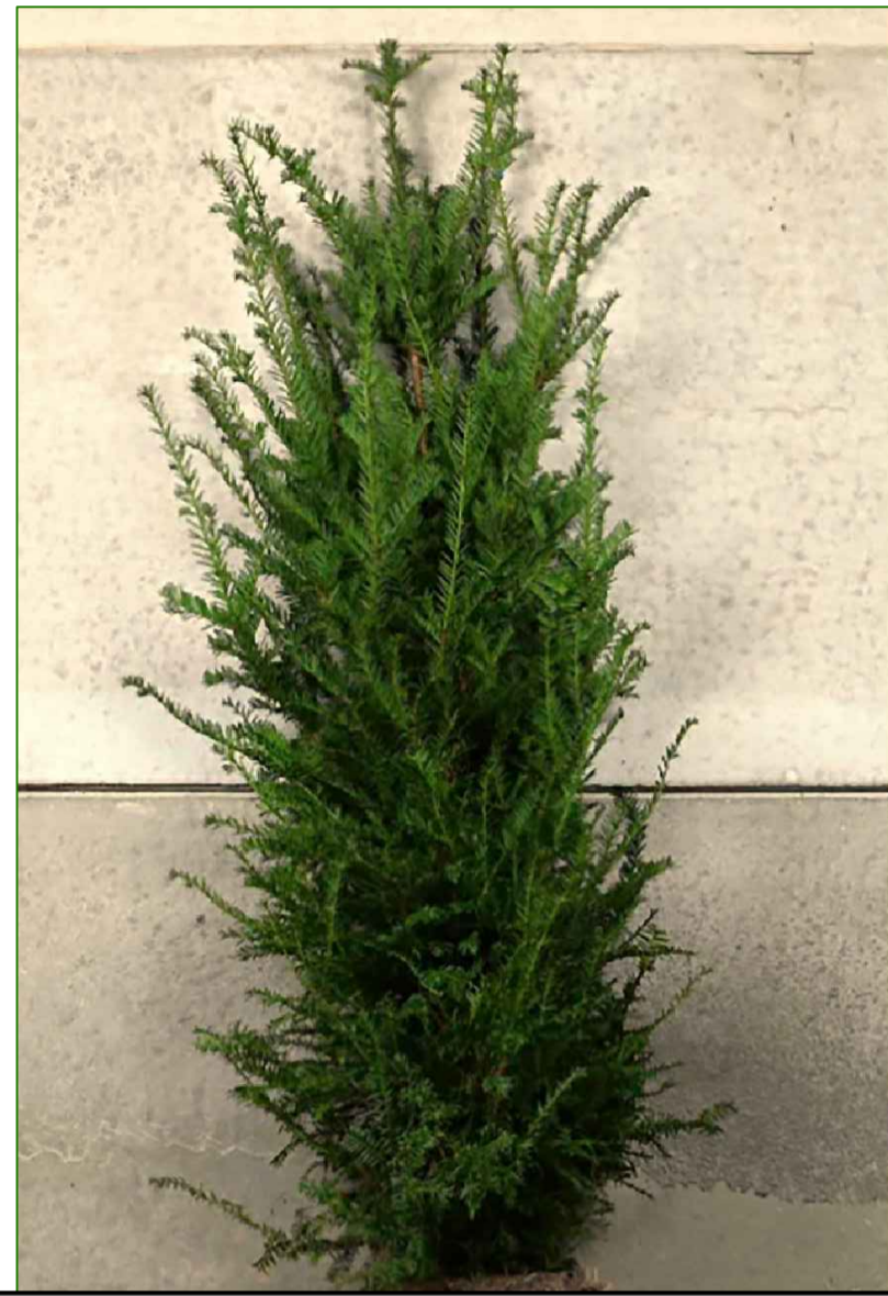
(TAXUS BACCATA) 20 NUMBER ENGLISH YEW 175CM ROOT BALL