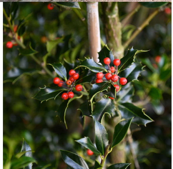
English Holly Berries