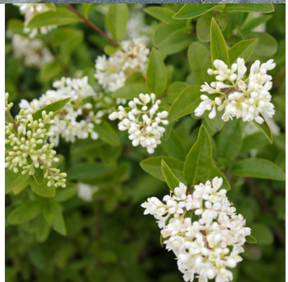
Wild Privet Flowers