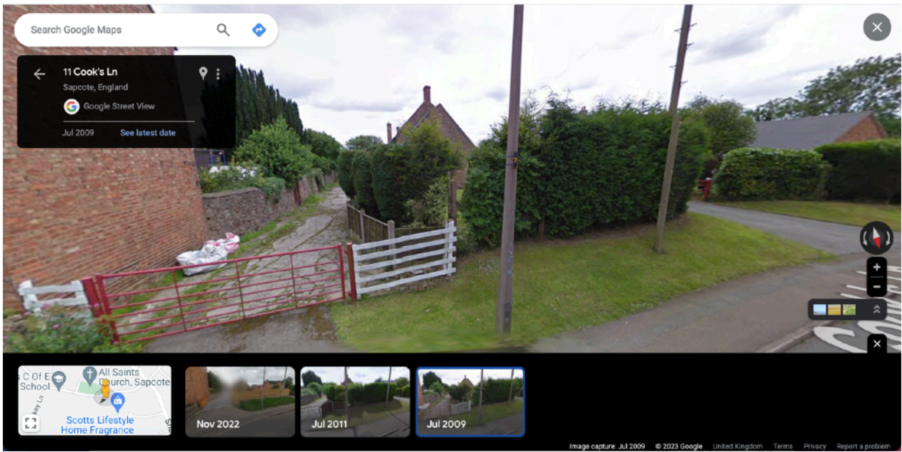
Frontage following Renovations but prior to New Planting.