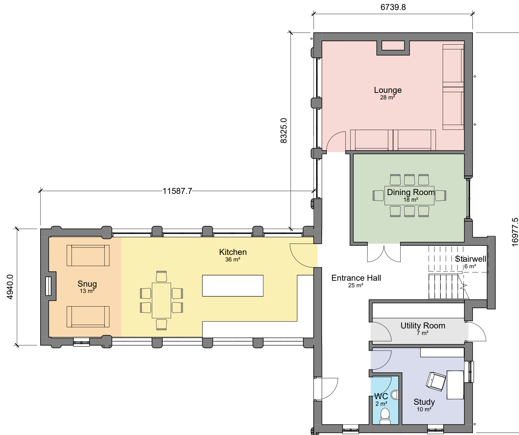
1 Plot 1- 00 - Ground Floor - Planning 1 : 100