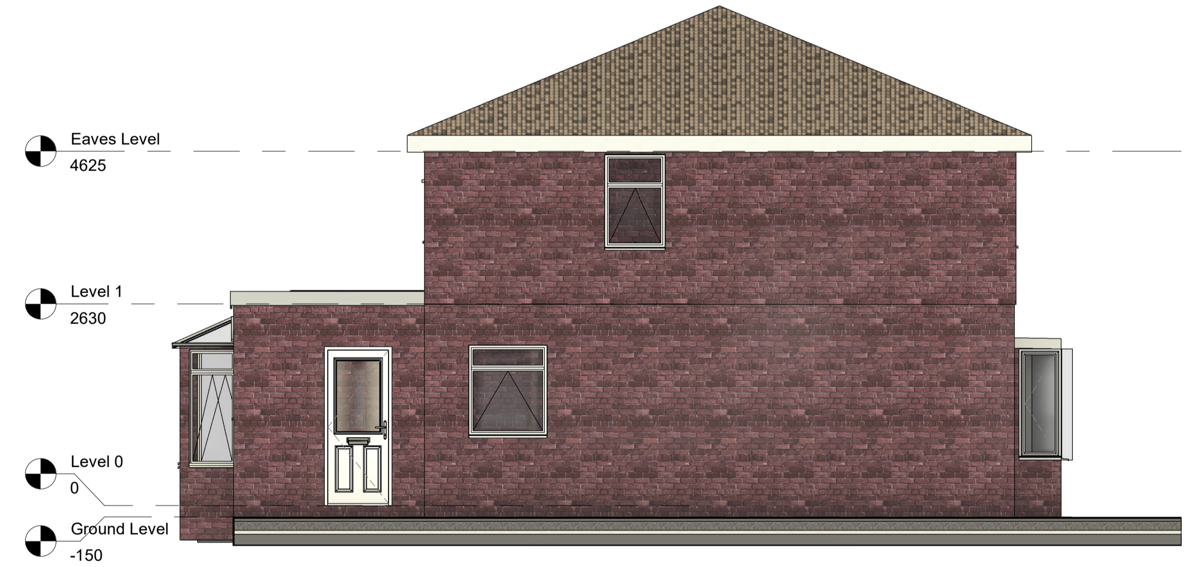
4 Existing Side Elevation 1 : 50

No 10 GWENCOLE AVE, BRAUNSTONE TOWN, LE3 2FG.