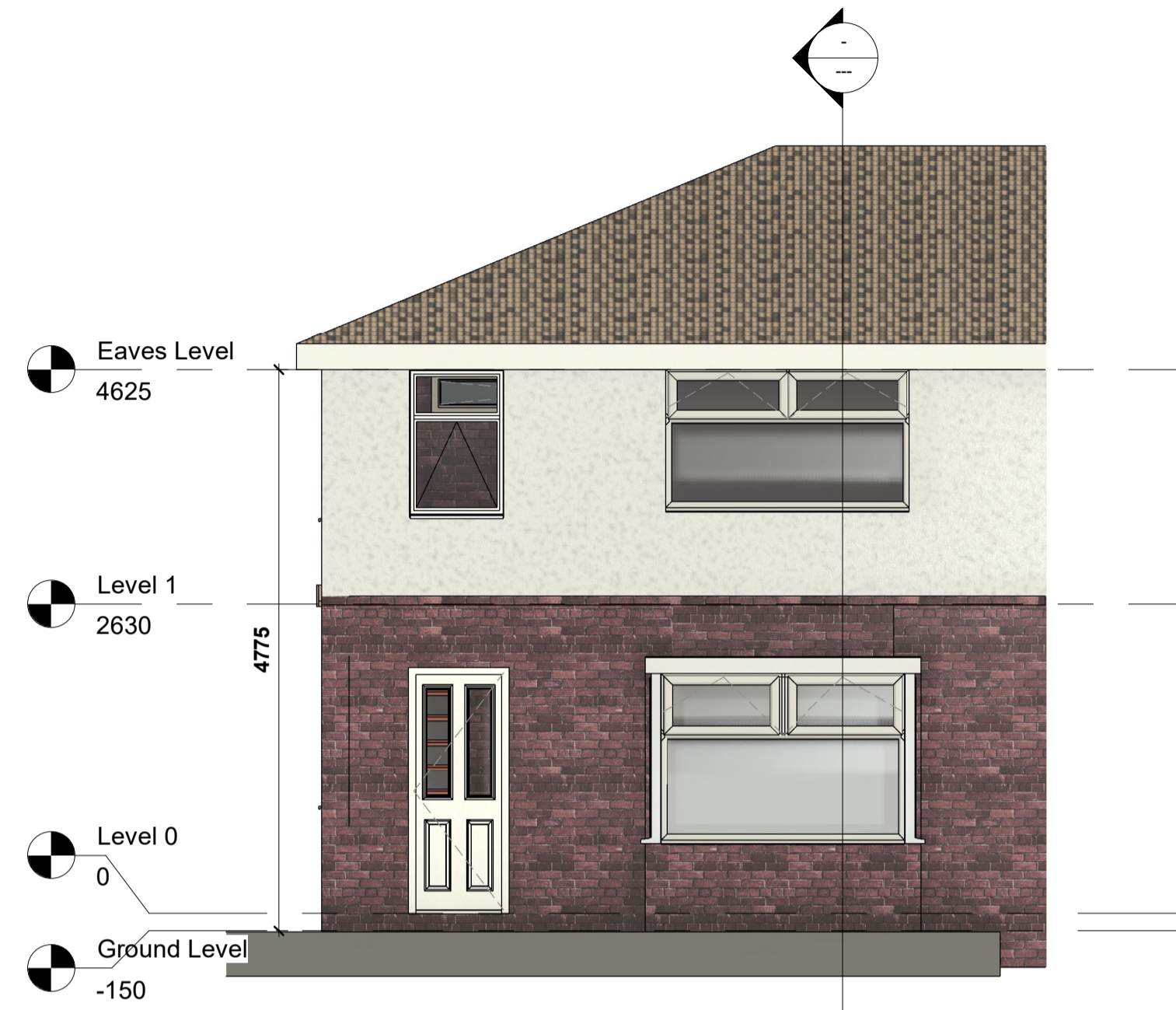
2 Existing Front Elevation 1 : 50