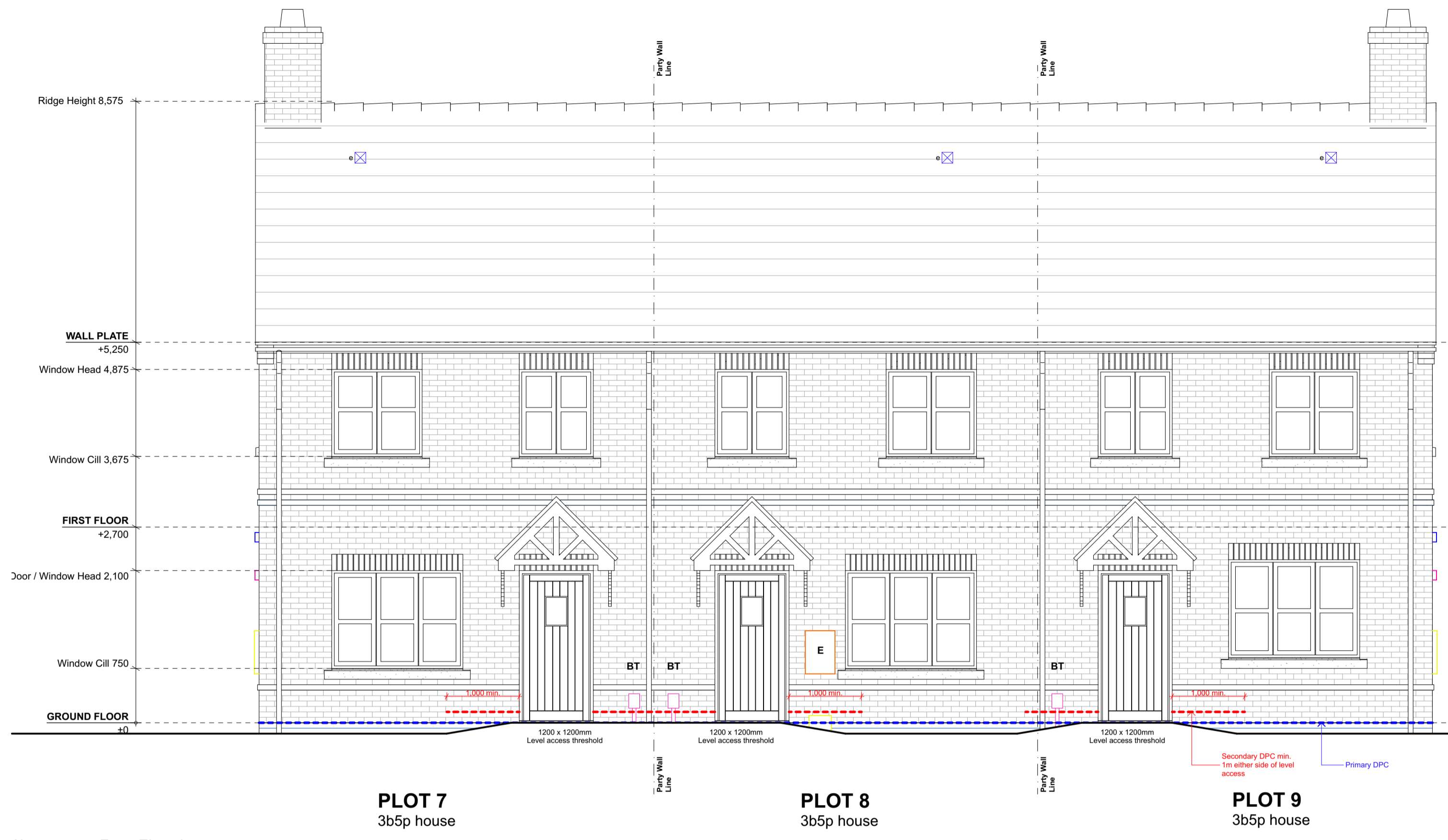
3b5p terrace Front Elevation 1:50