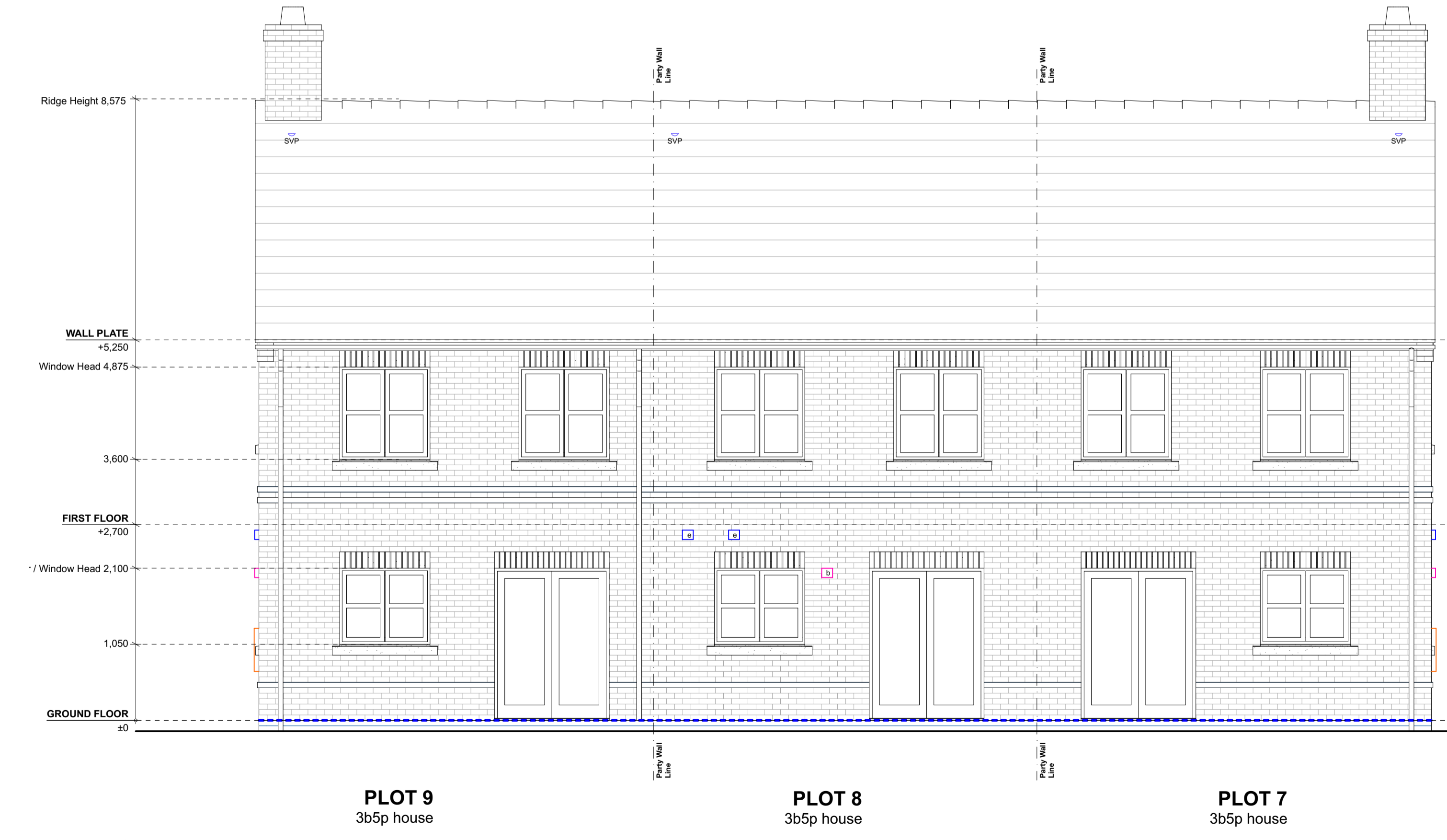
3b5p terrace Rear Elevation 1:50