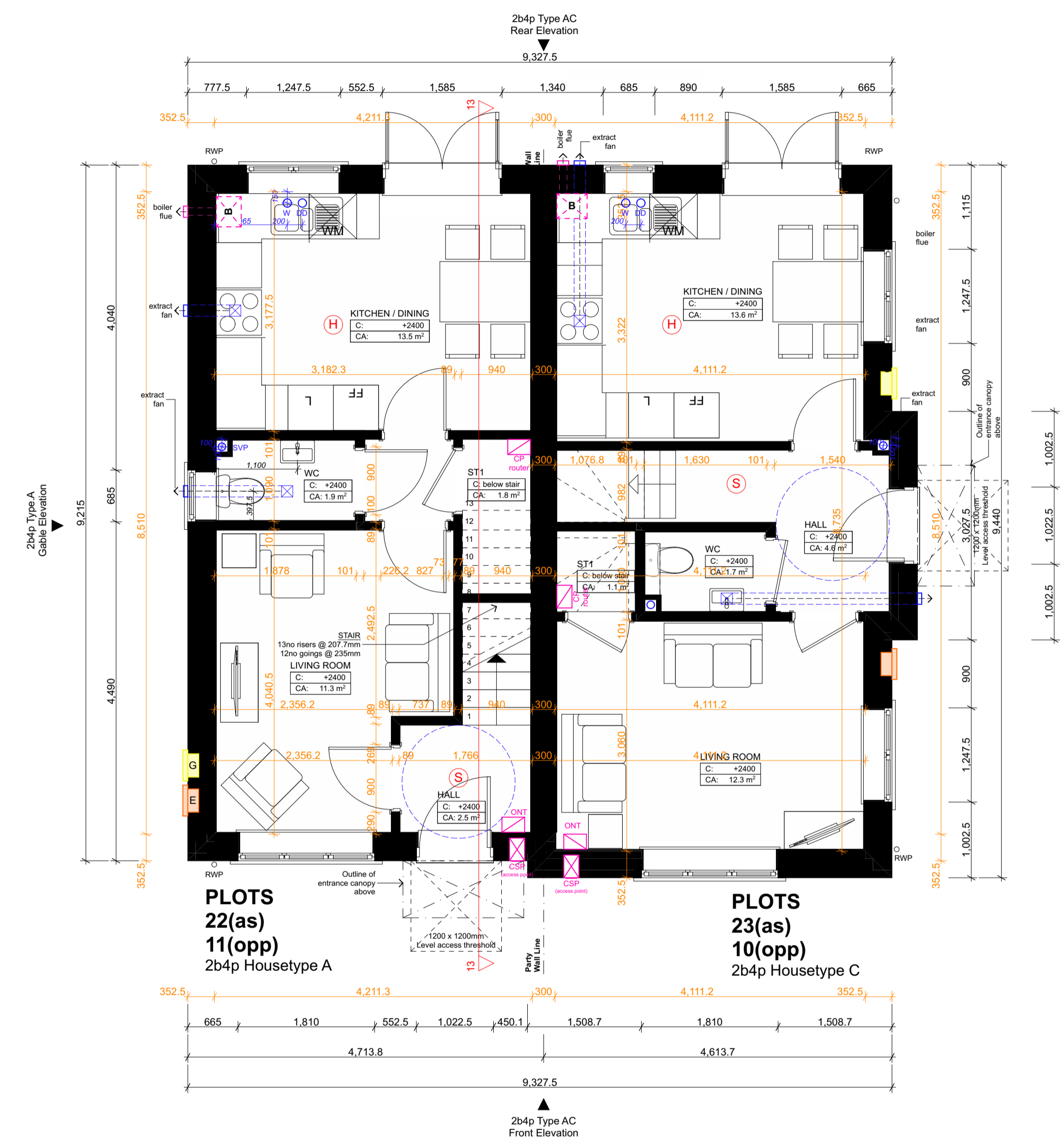
2B4P Type AC Housetype - GROUND FLOOR 1:50