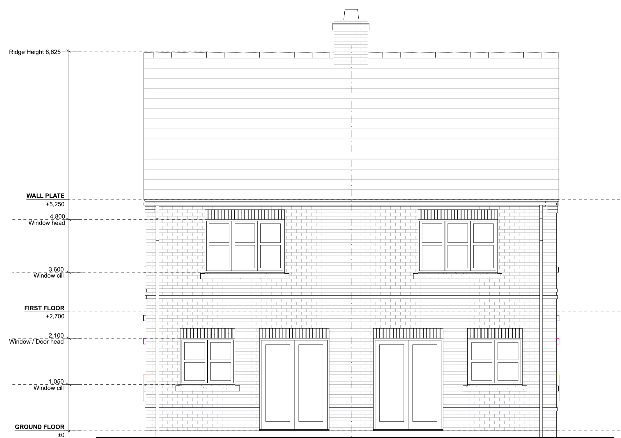
PLOTS 18(as) 20(as) 2b4p Housetype