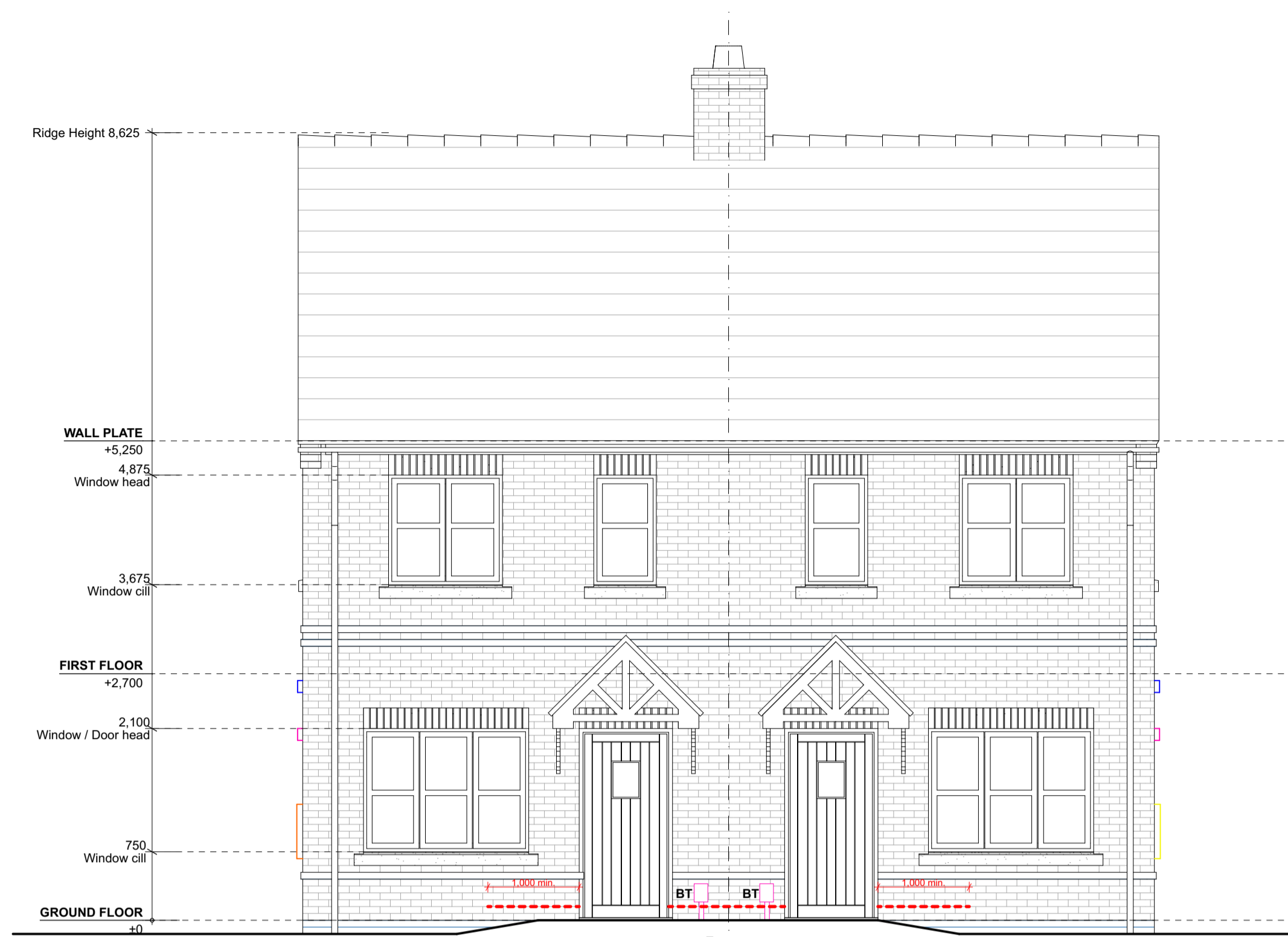
PLOTS 18(as) 20(as) 2b4p Housetype