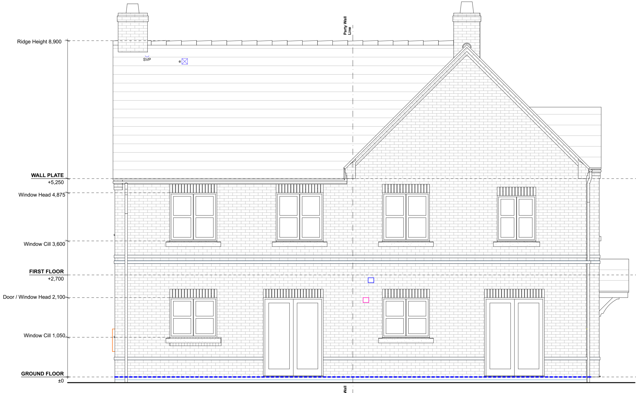
PLOT 2 4b6p housetype