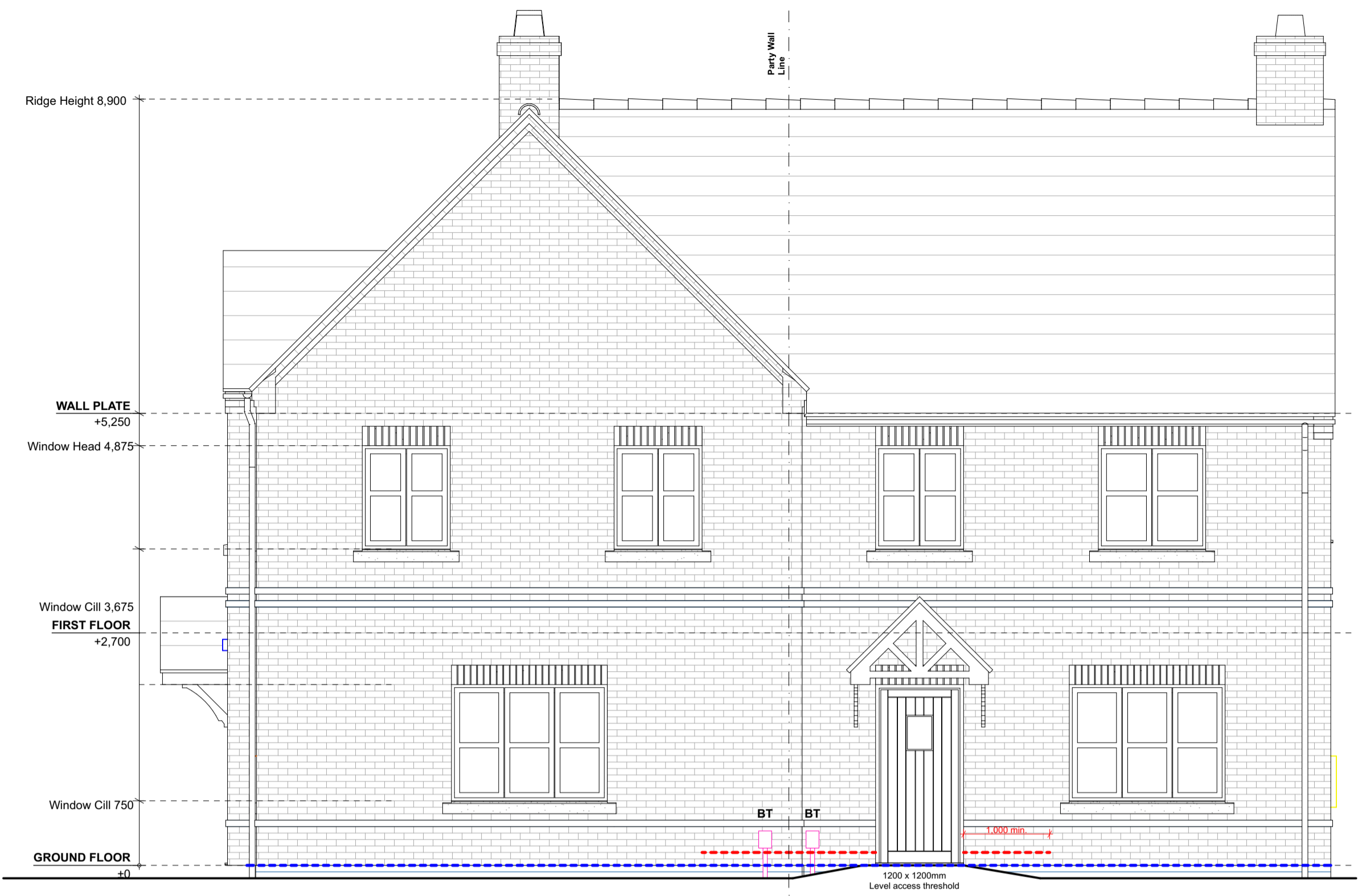
PLOT 1 4b6p housetype