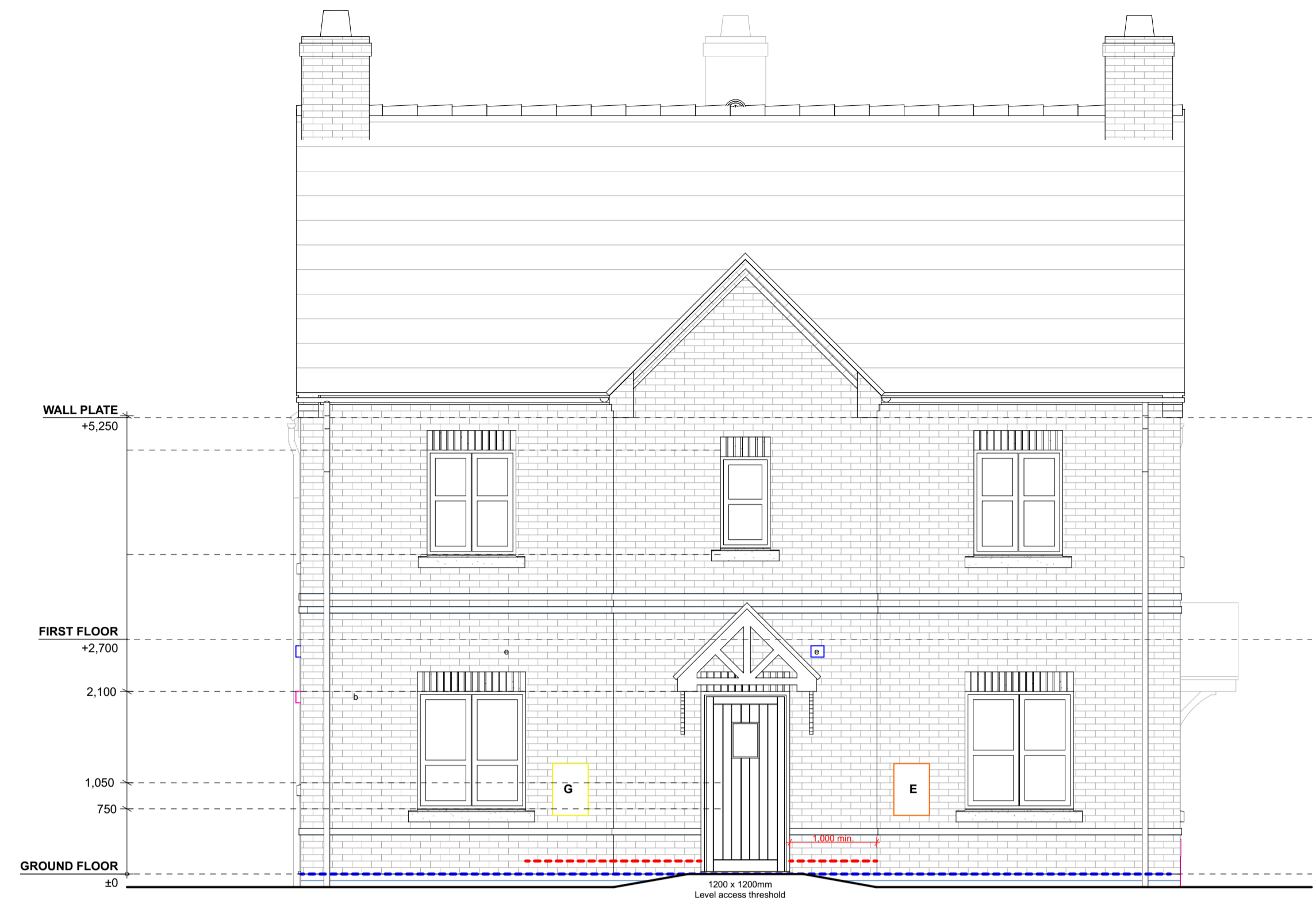
PLOT 1 4b6p housetype