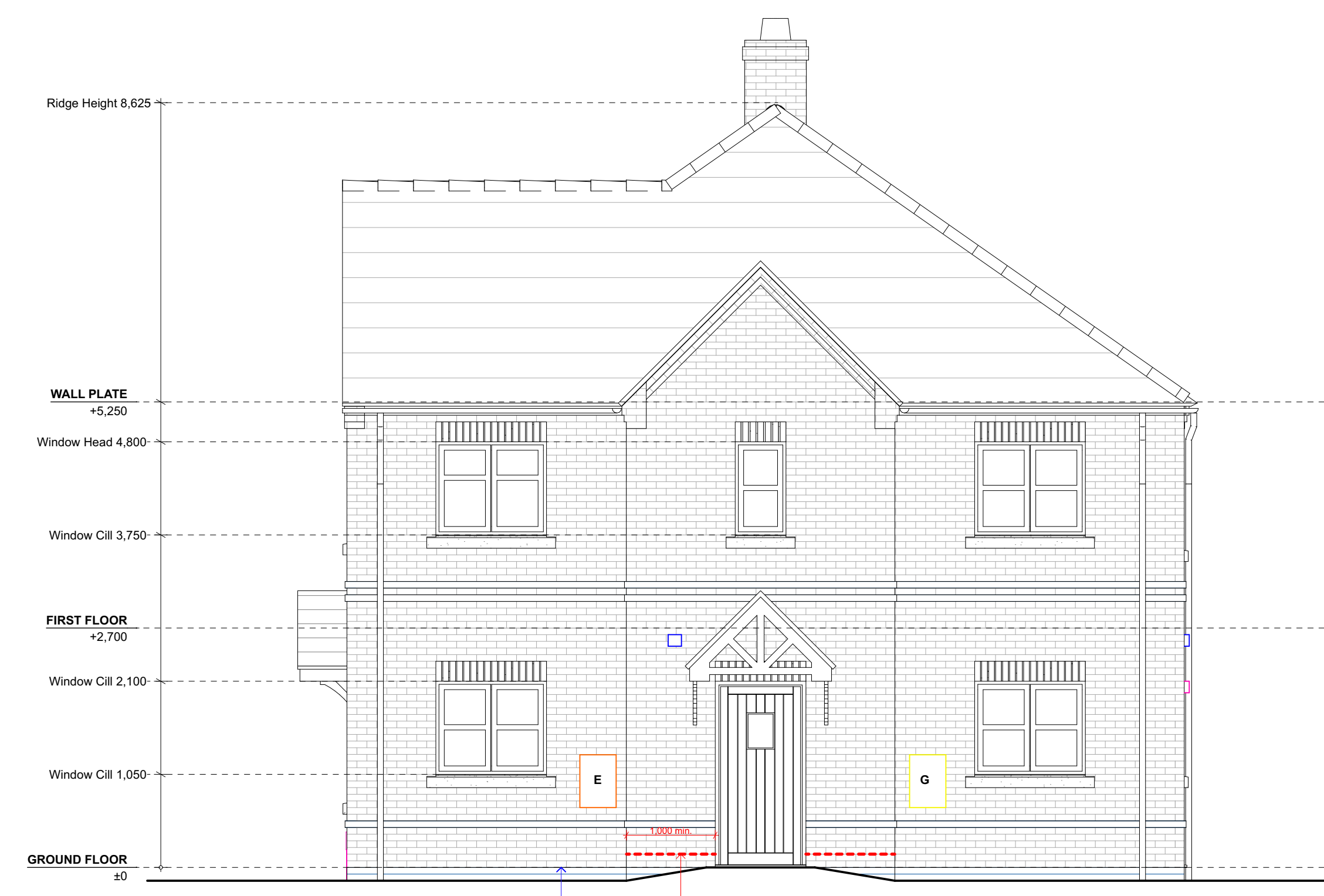
Type C Gable Elevation 1:50