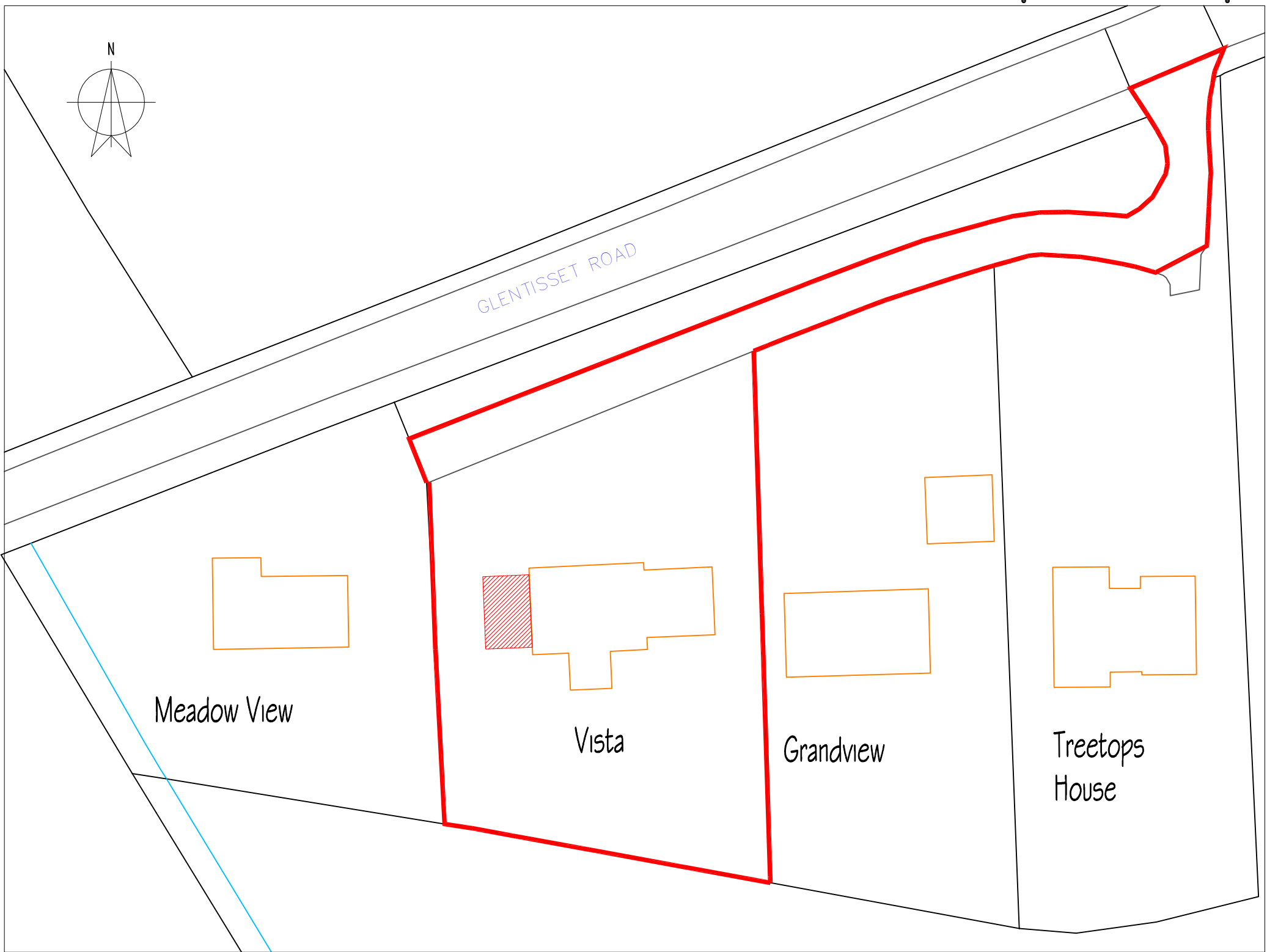
Block Plan - 1:500

Produced on 20 February 2024 from the Ordnance Survey National Geographic Database and incorporating surveyed revision available at this date.