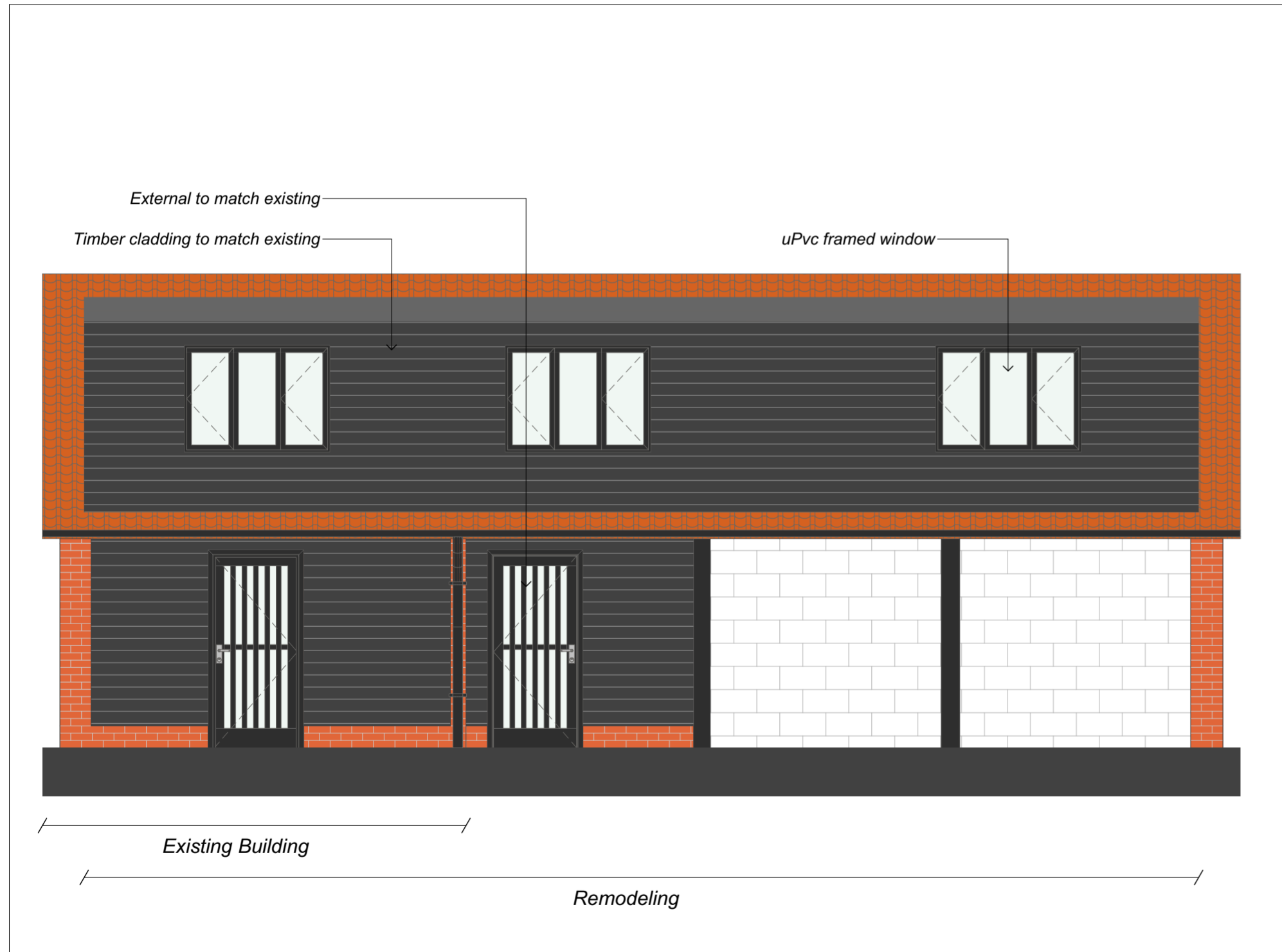
Proposed South Elevation - 1:50