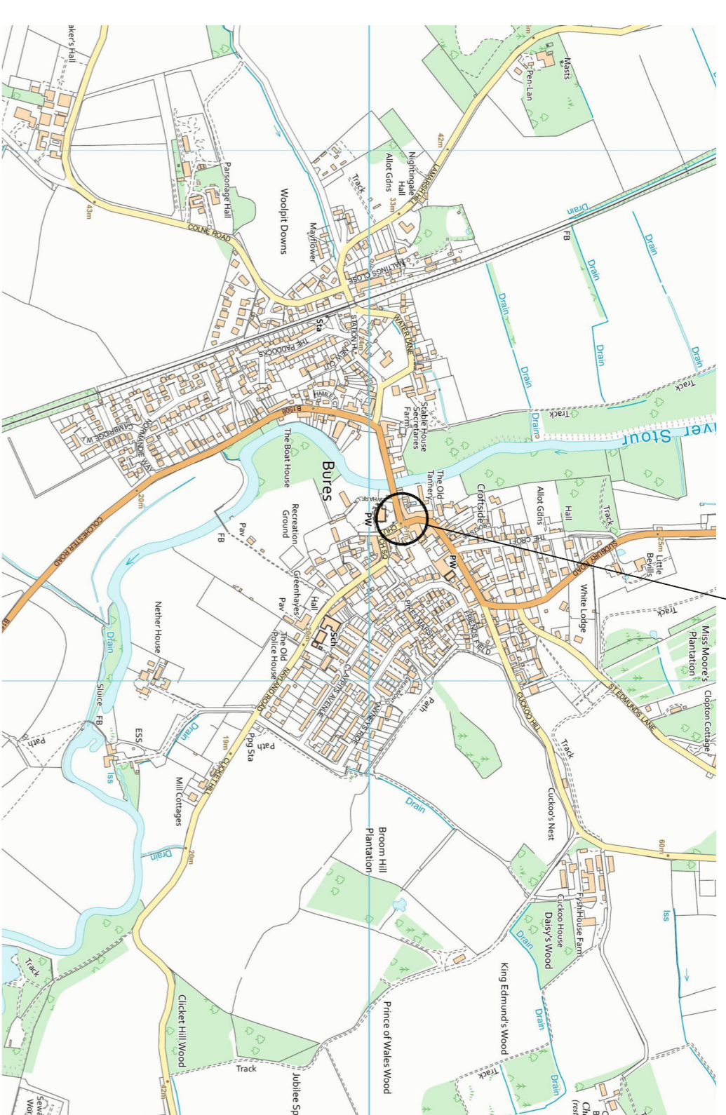
LOCATION PLAN SCALE 1:10000