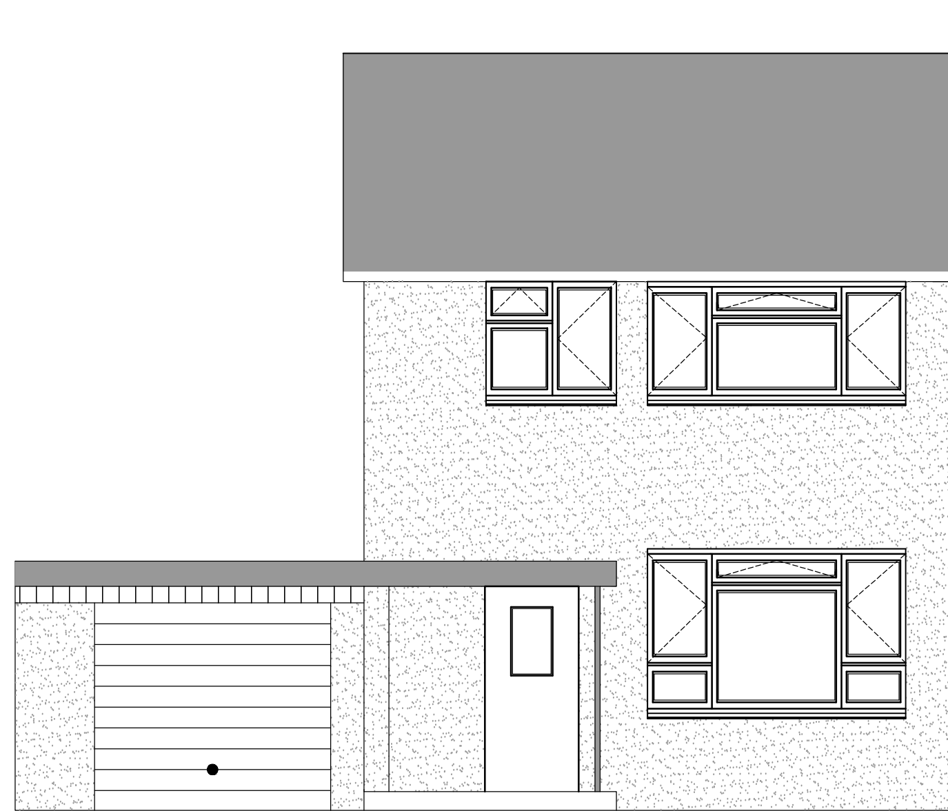
FRONT ELEVATION OF No. 35 (SW/SOUTH FACING) 1:50