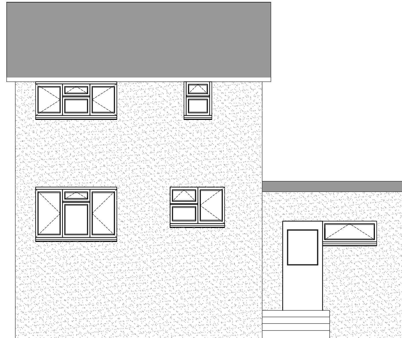
REAR ELEVATION OF No. 35 (NE/NORTH FACING) 1:50