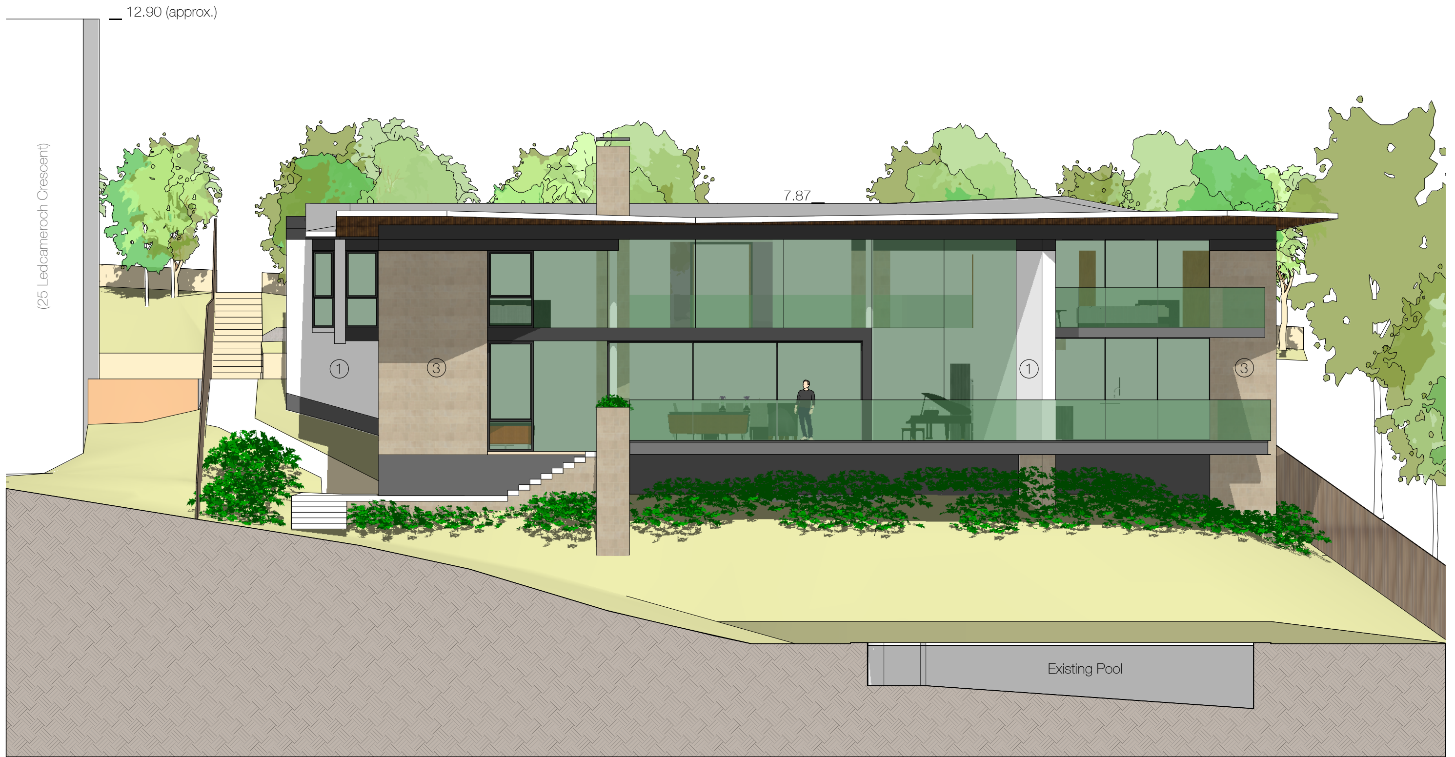
SOUTH WEST ELEVATION AS PROPOSED 1:100 @ A3