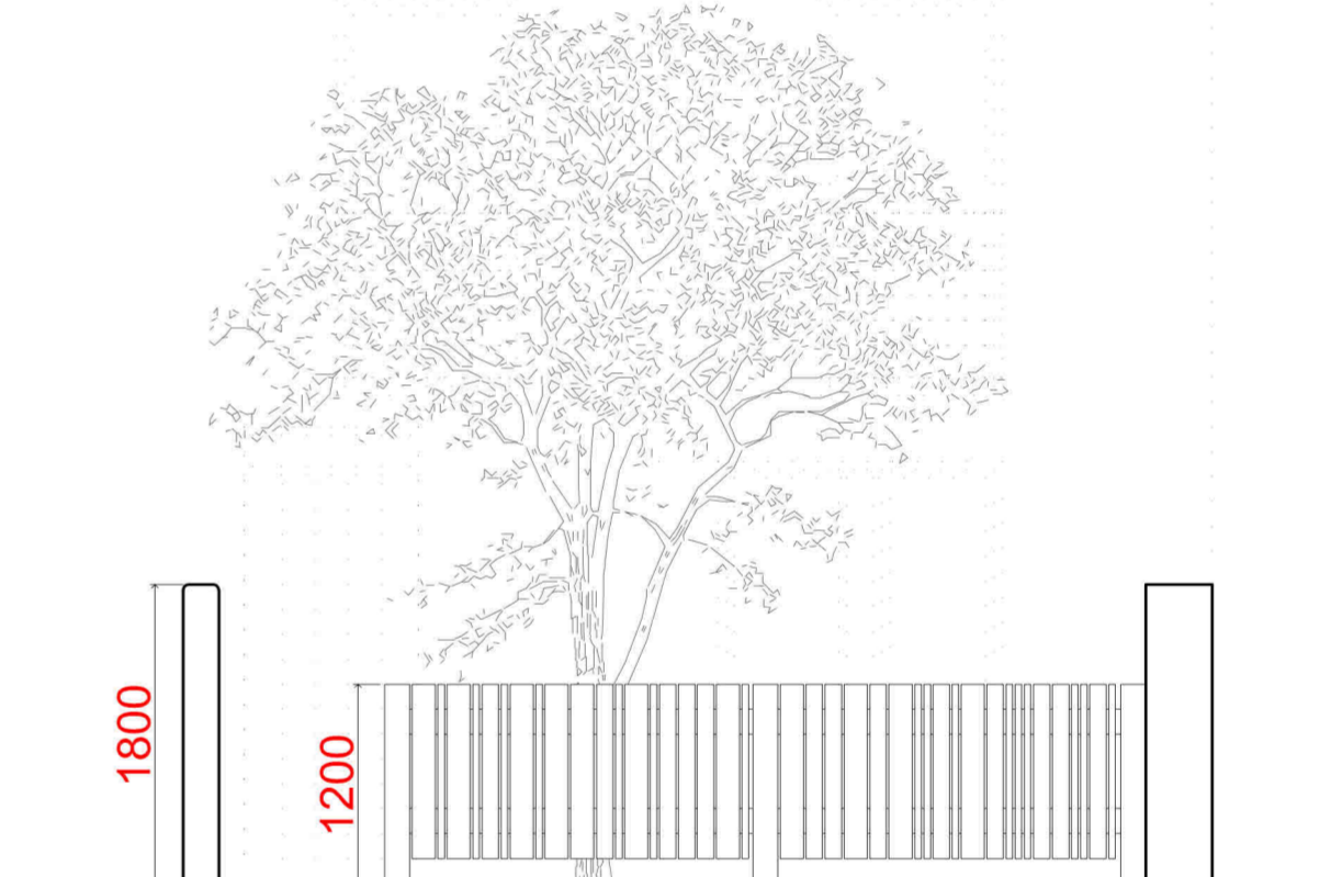
timber fence rear property 1:50