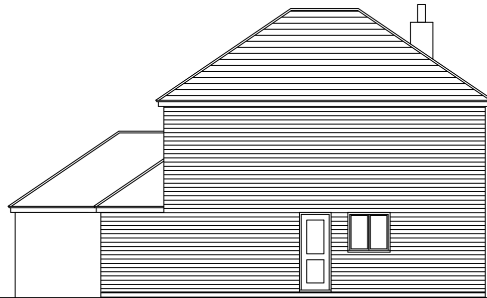
Existing side elevation