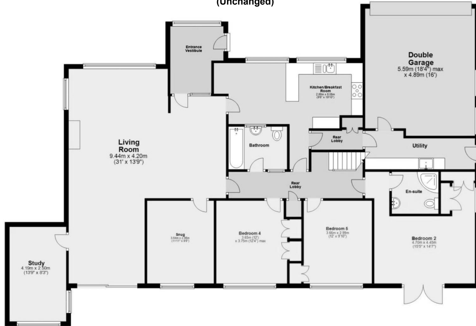
Ground Floor Approx. 195.6 sq. metres (2105.2 sq. feet) (Unchanged)