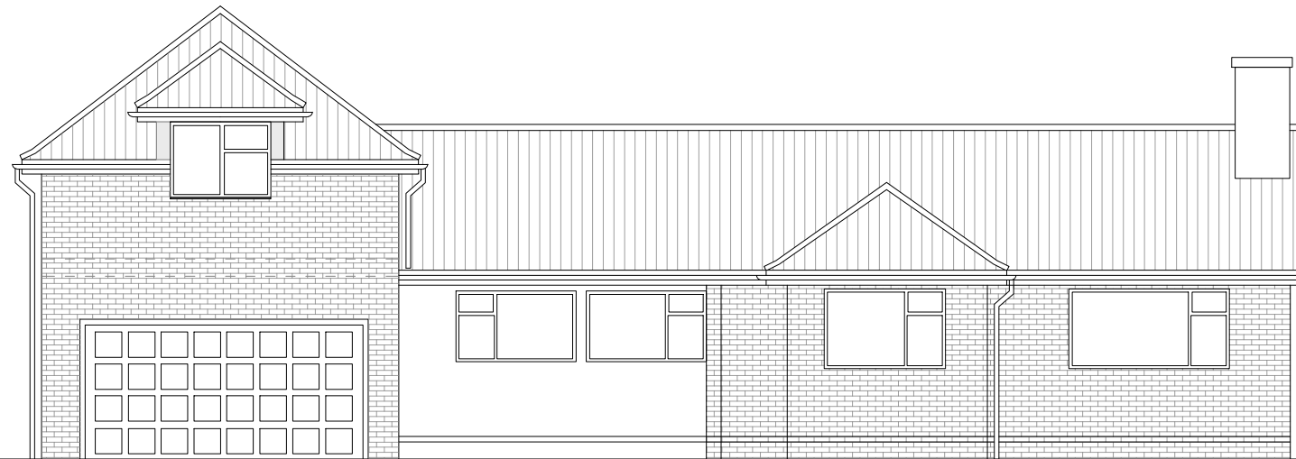
Existing front elevation (SE) All other elevations remain unchanged