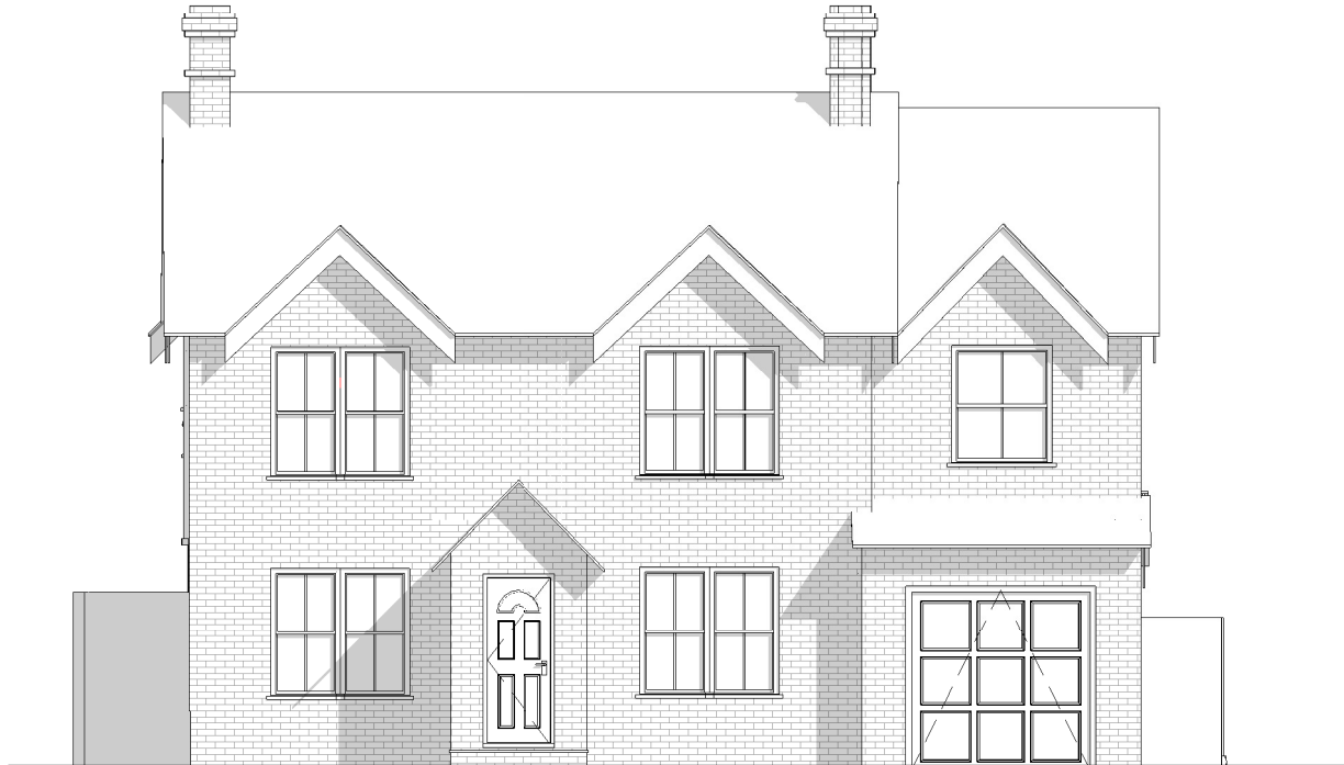
Existing West 1 : 100