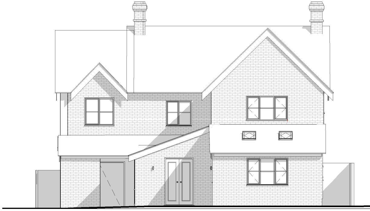
Existing East 1 : 100