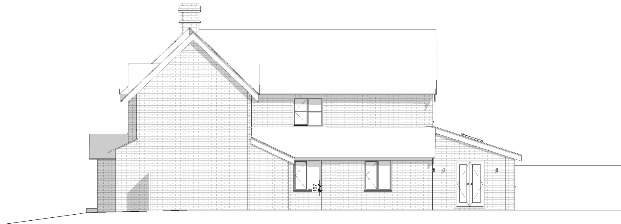
Existing South 1 : 100