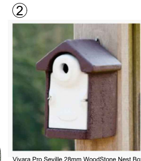
② Vivara Pro Seville 28mm WoodStone Nest Box (or similar approved) • Located on existing tree / fence at a height of at least 1.5m • Facing between north and east