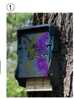
① Schwegler 1FF Bat Box (or similar approved) • Located on existing tree between 4m and 6m height. • Facing between east and south