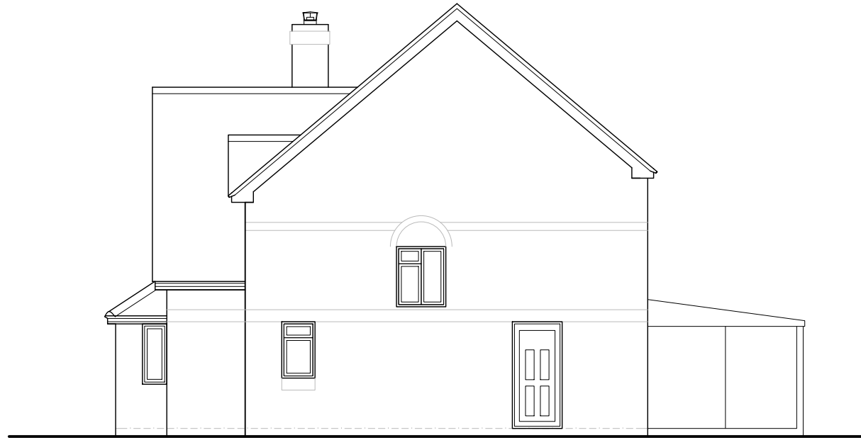
North (side) Elevation | existing