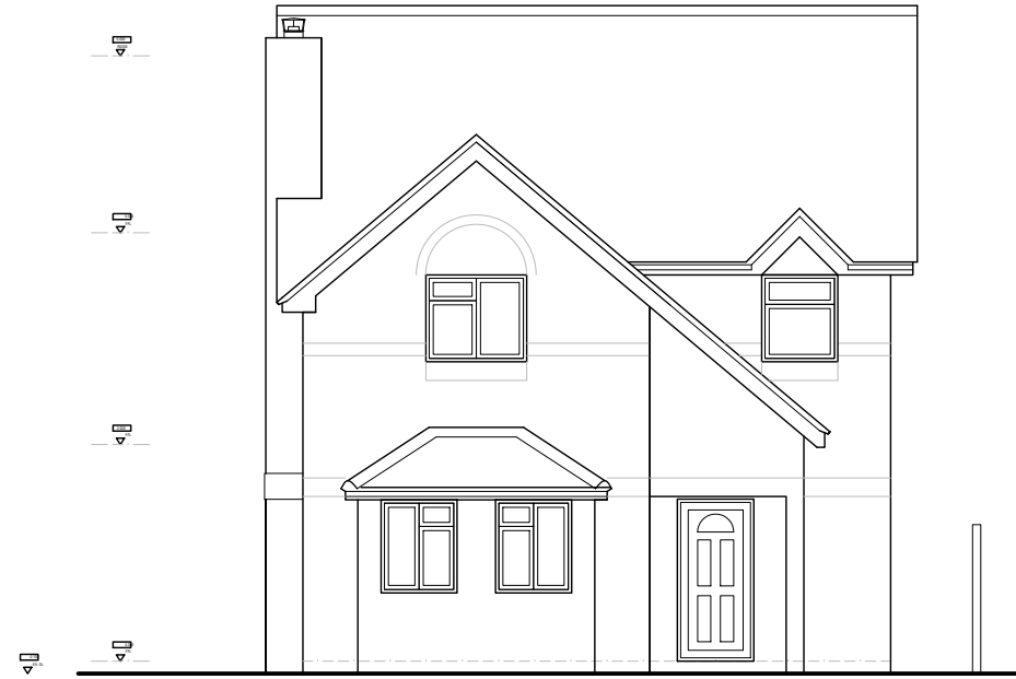
East (front) Elevation | existing