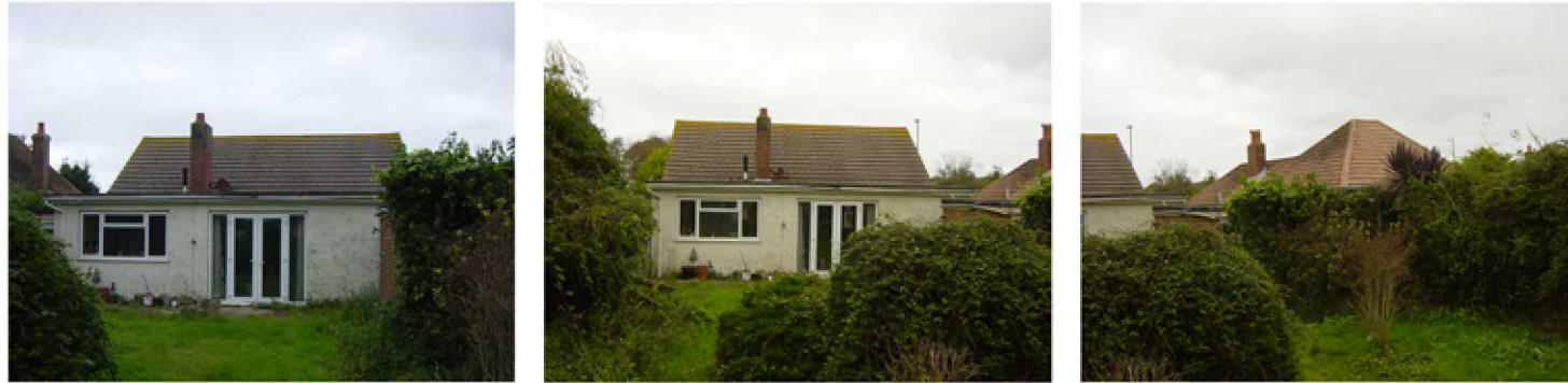
Rear of house - from garden