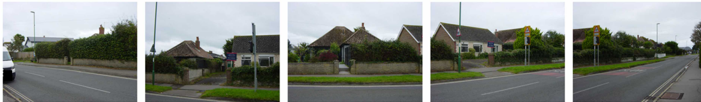
Street scene - stocks lane