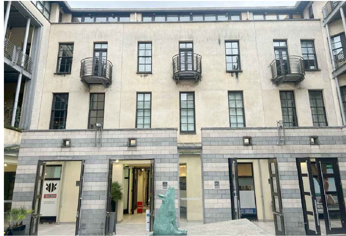
Existing North Elevation - January 2024

Please do not scale from this drawing. All dimensions should be checked on site prior to commencing construction work. If in doubt please ask.