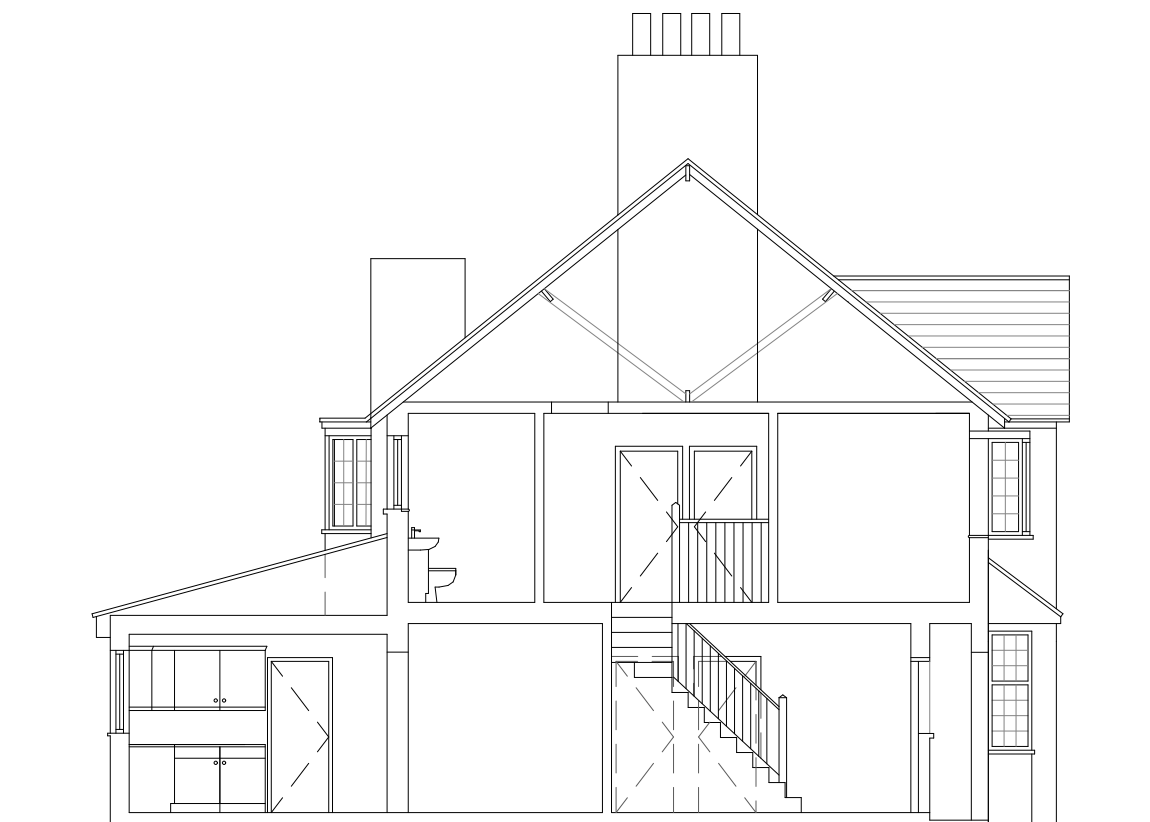
2 Existing Section 1:100 @ A3