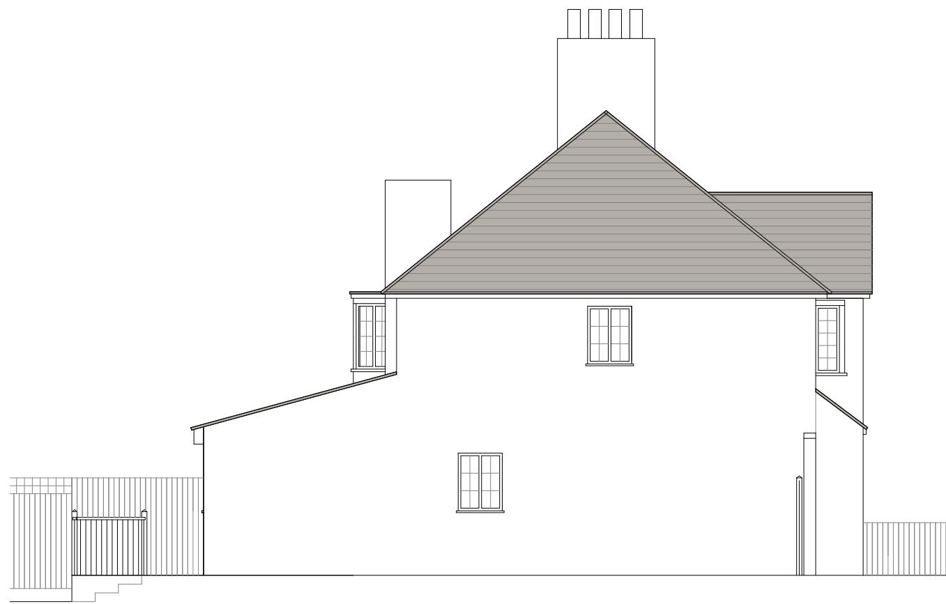
1 Existing Side Elevation 1:100 @ A3

Copyright in this drawing remains the property of Studio Jayga Architects and may not be copied or used without permission.