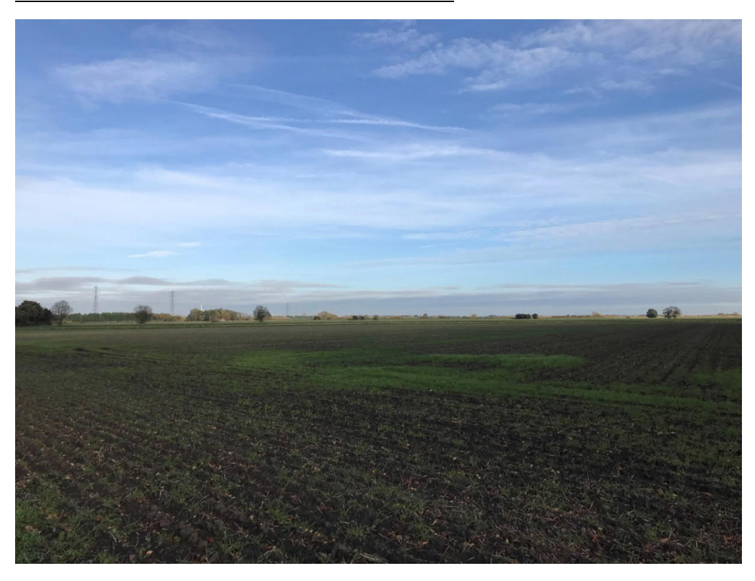
Photograph 19: View north east across Field 216 in the area of the planning application boundary.