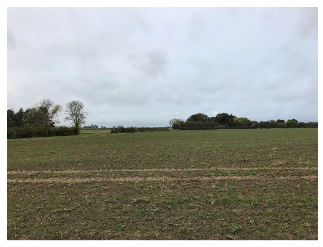
Photograph 6: Area of planning application boundary in Field 92 near the ring ditch recorded on aerial photography (MHU8124).