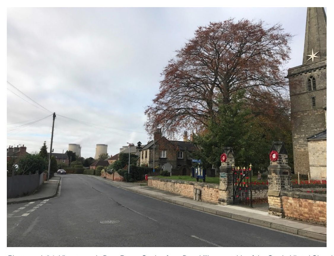
Photograph 24: View towards Drax Power Station from Drax Village outside of the Grade I listed Church of St Peter and St Paul (LB1148397).