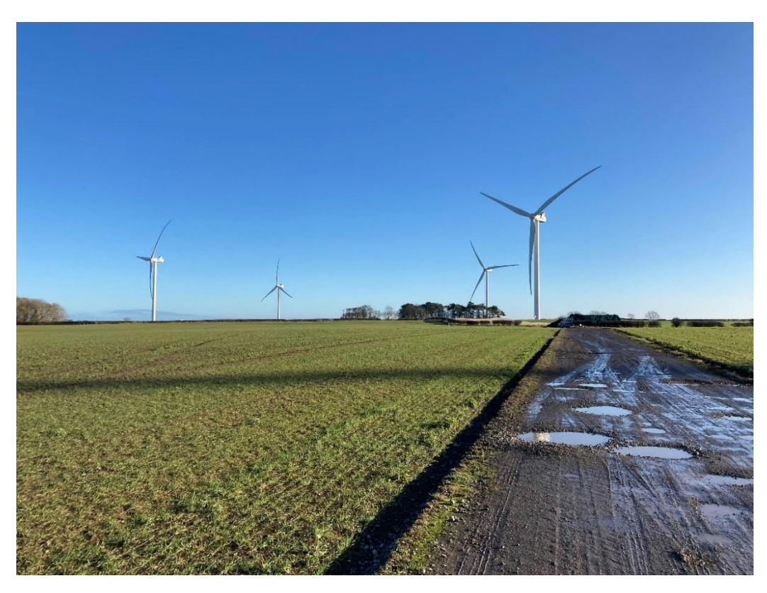
Photograph 3: View east across the planning application boundary in the area of Fraisthorpe wind farm (Field 8).