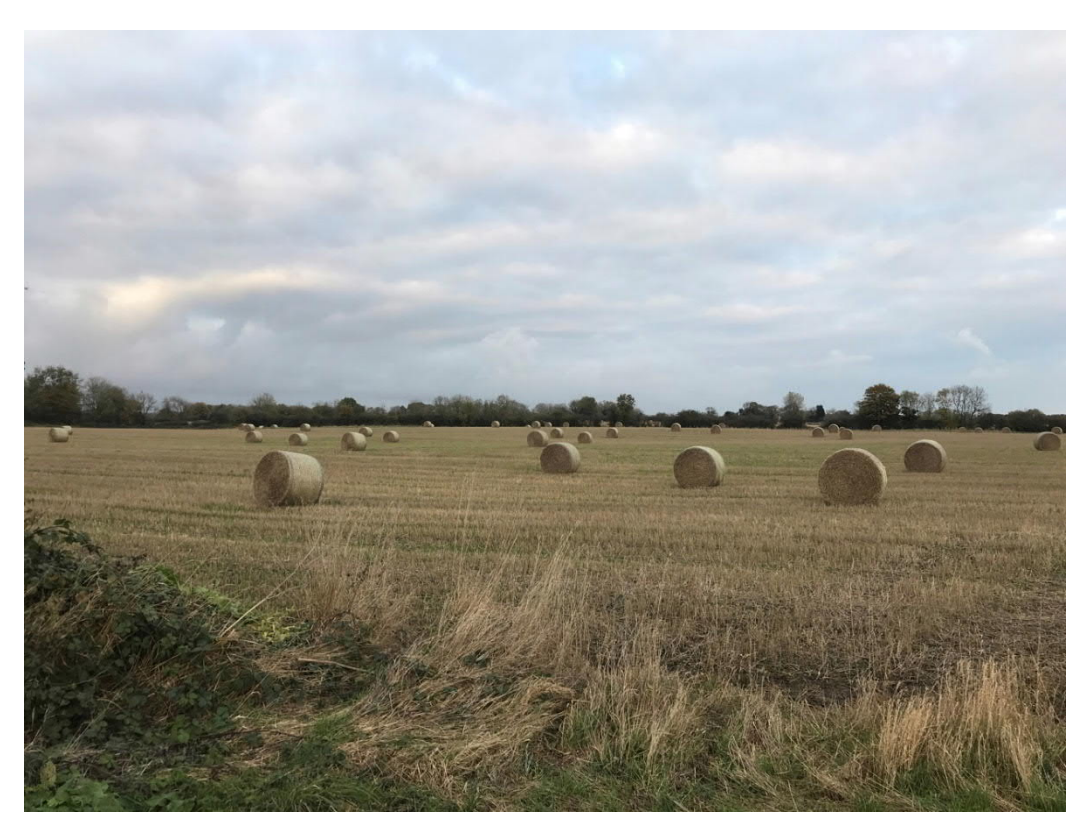
Photograph 5: Area of planning application boundary in Field 47.