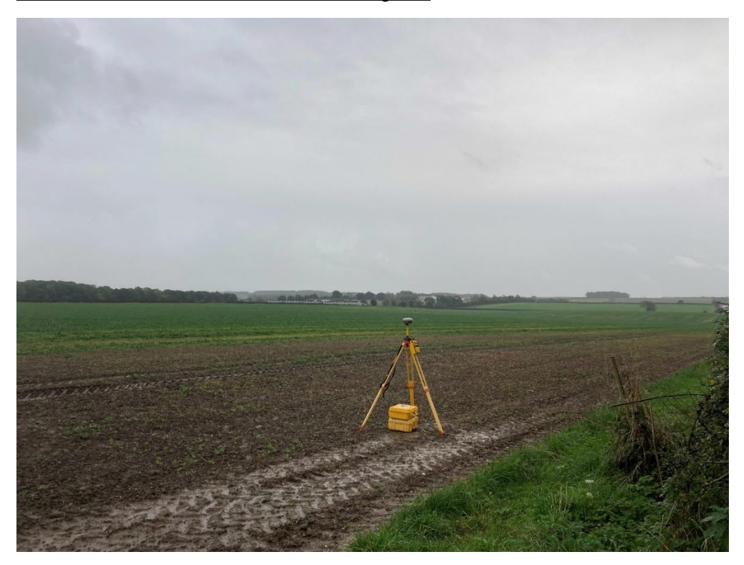
Photograph 7: View south east across the planning application boundary in Field 102 showing the landscape dropping away towards Lund.