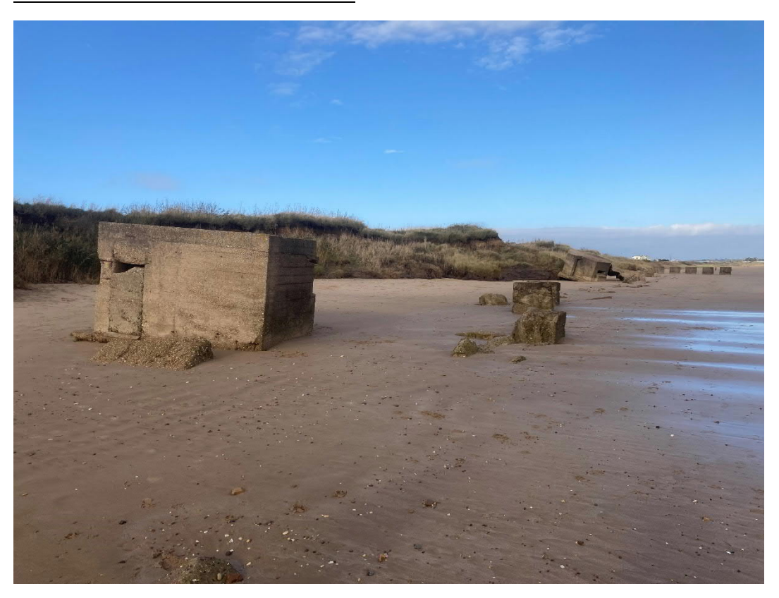
Photograph 1: View of landfall from the south. The planning application boundary passes between the anti-tank blocks (MHU21031) and the pillbox (MHU21027) in the distance.