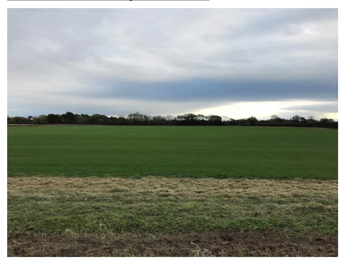
Photograph 13: View to the south across the planning application boundary as it passes through Field 142.