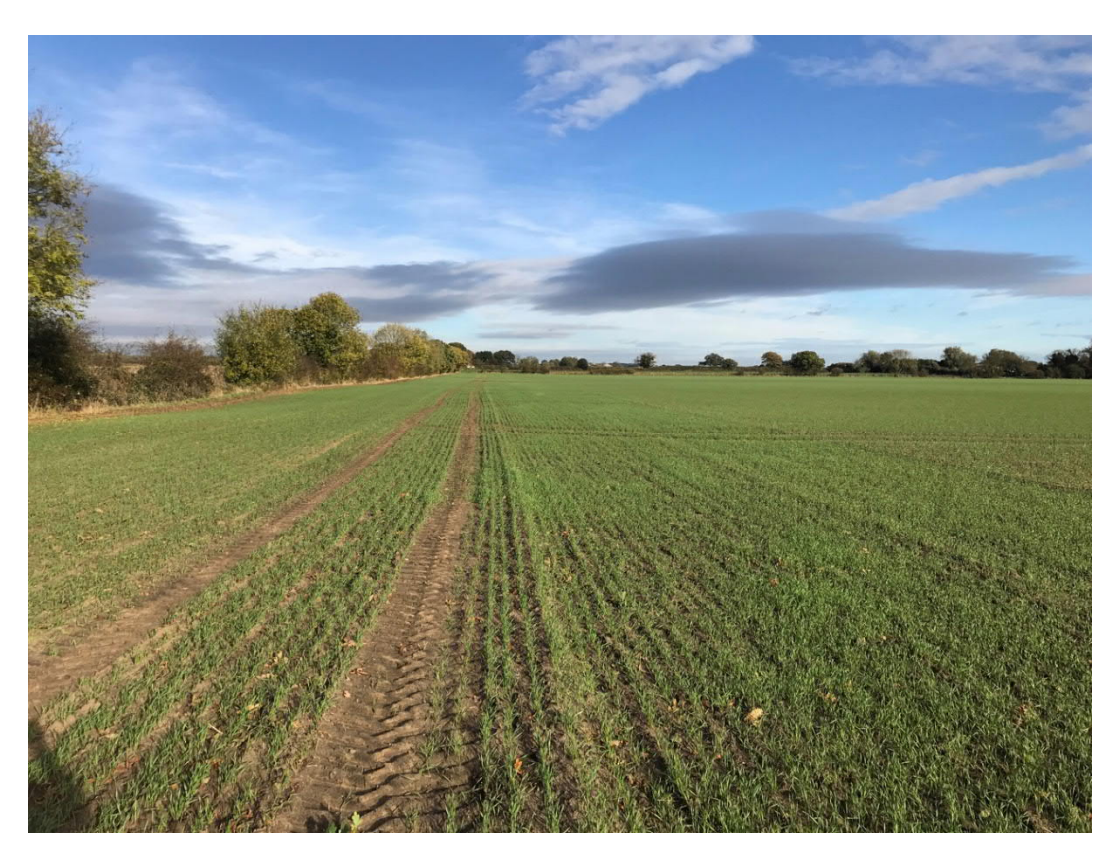
Photograph 15: View north eat along the planning application boundary as it passes through Field 159 in the area of the former pottery kilns (MHU1161).