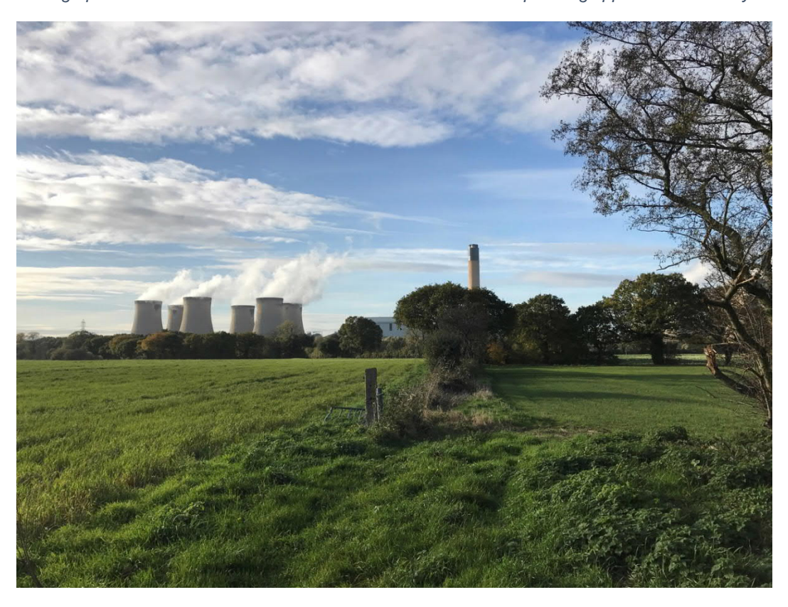
Photograph 20: View towards Drax Power Station from the planning application boundary in Field 218.