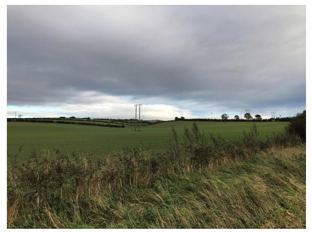
Photograph 12: View north east along the planning application boundary as it passes through Field 135, and the Roman roadside settlement recorded through geophysical survey (AECOM XXX).