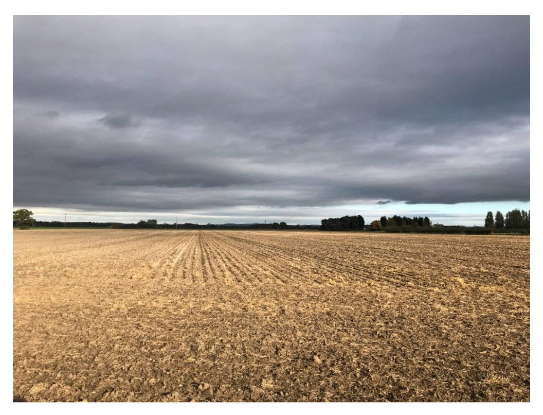
Photograph 17: View along the planning application boundary as it passes through Field 164.