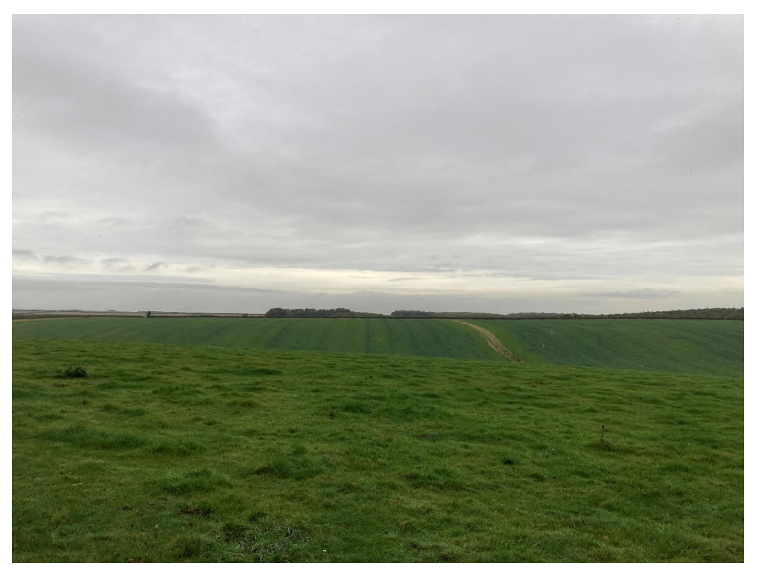
Photograph 8: View of the Wolds landscape in the area of Field 127 where the cable will be HDD rather than open cut trench.