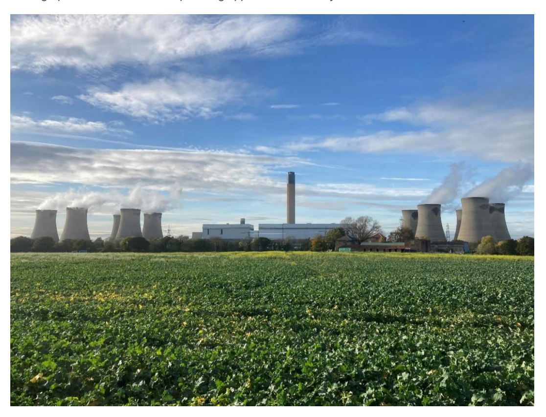
Photograph 22: View east across the planning application boundary in Field 219. Wren Hall (AECOM012) can be seen right of centre.