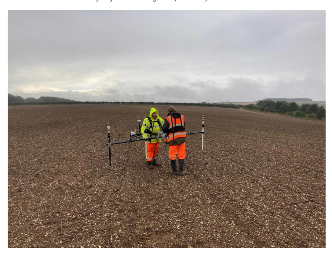
Photograph 10: Geophysical survey being undertaken in Field 128.