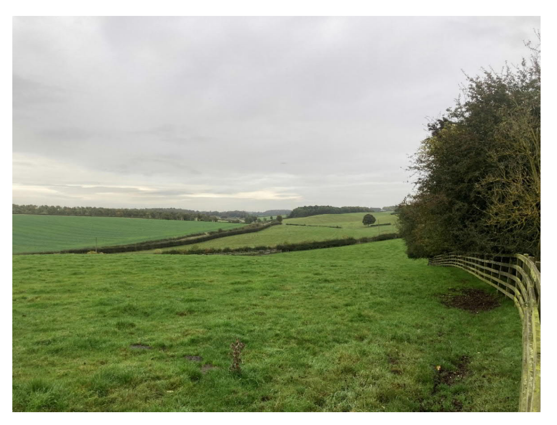
Photograph 9: View east across Field 127 and the wolds landscape from the former railway line. The scheduled oval barrow lies immediately beyond the hedgerow (1012203).