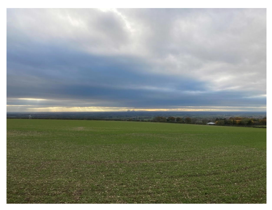
Photograph 11: View west along the planning application boundary from edge of Field 132. Note Drax in the distance.