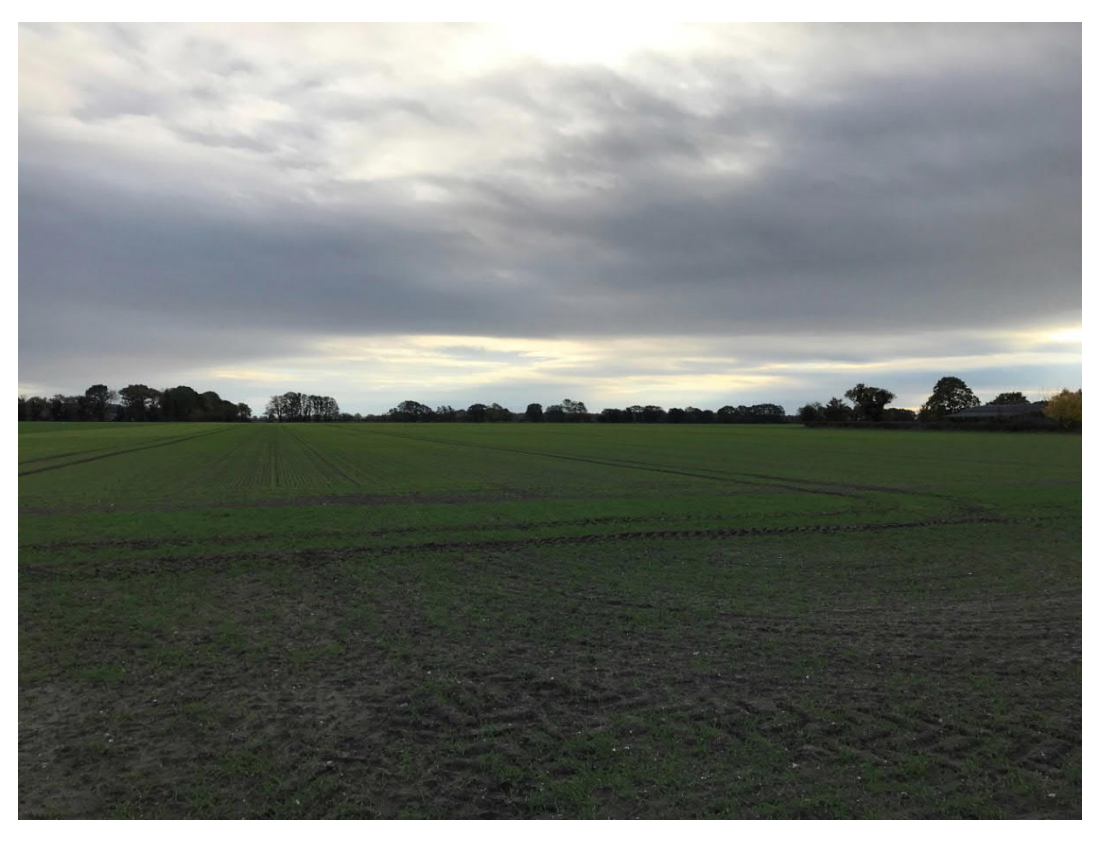
Photograph 14: View south across the planning application boundary in Field 145 where an extensive Iron Age/Romano-British settlement site has been recorded through aerial photography (MHU7347).