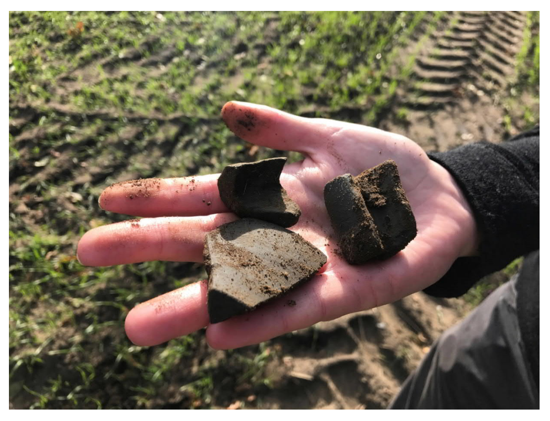
Photograph 16: Roman pottery, assumed to be from the Tollingham pottery kilns site (MHU1161), visible up in Field 159.