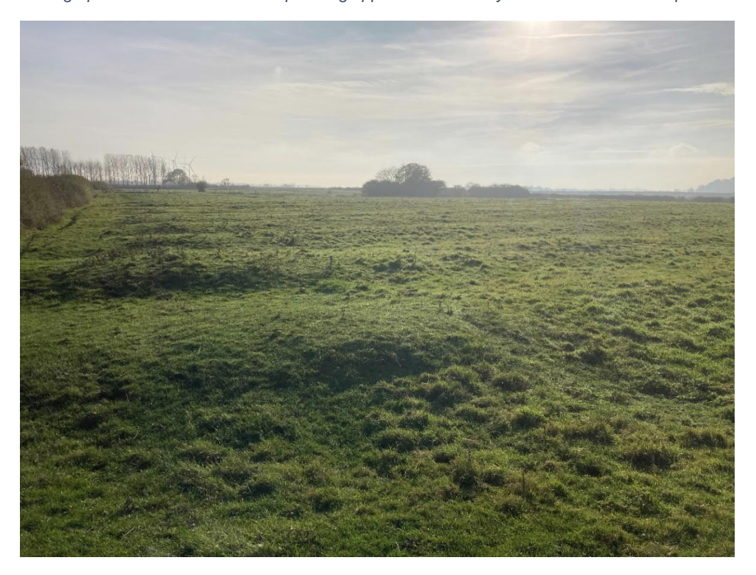
Photograph 4: Ridge and furrow cultivation surviving as earthworks north of Gransmoor.