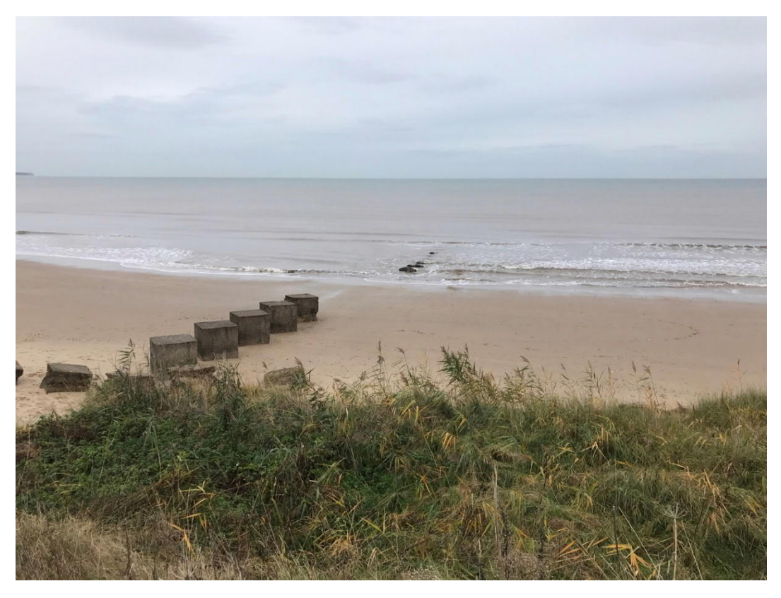
Photograph 2: Landfall viewed from the west showing the anti-tank blocks (MHU21031) that are positioned on the north side of the planning application boundary.