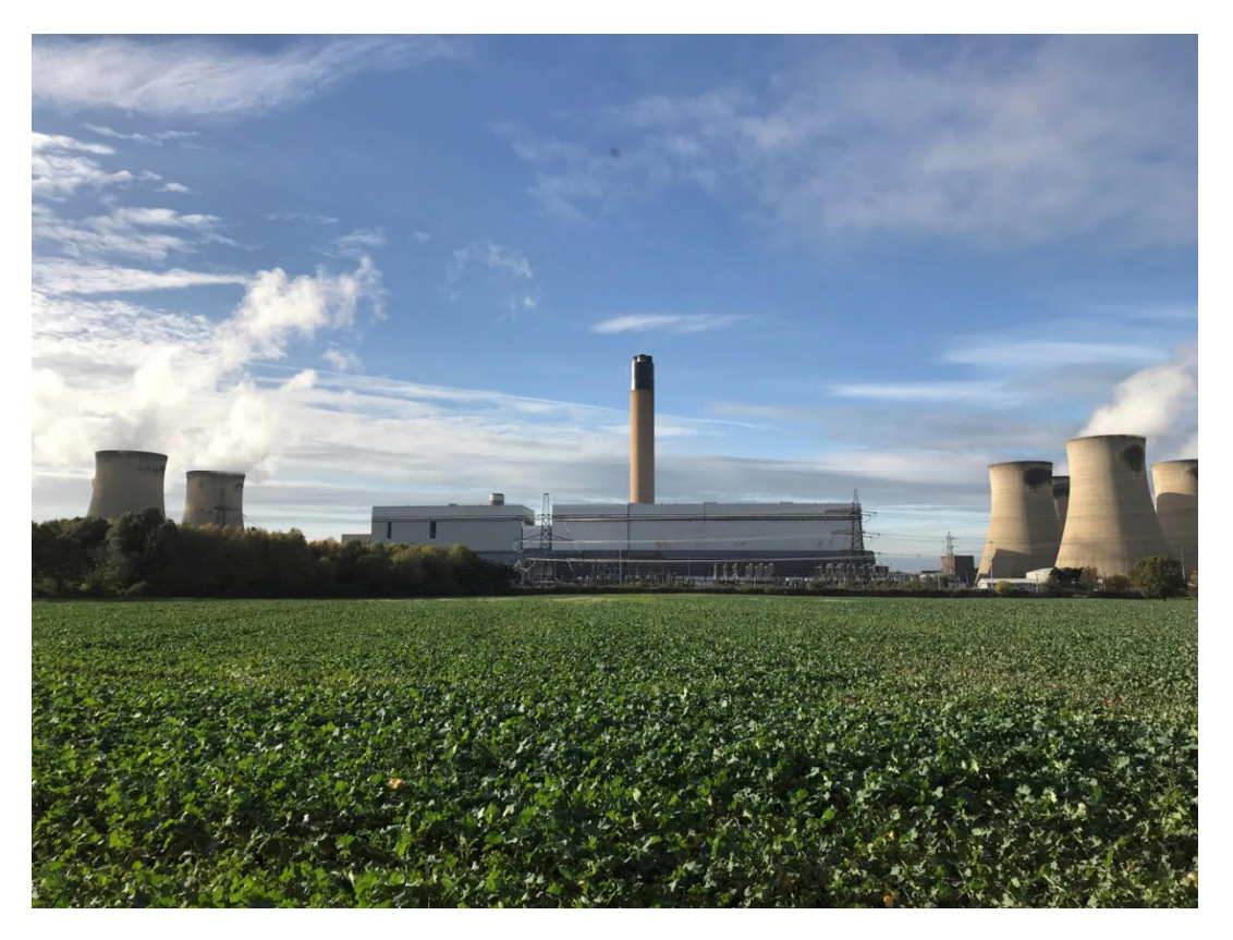
Photograph 23: View of the proposed converter station site in Field 220 with the existing Drax Power Station in the background.