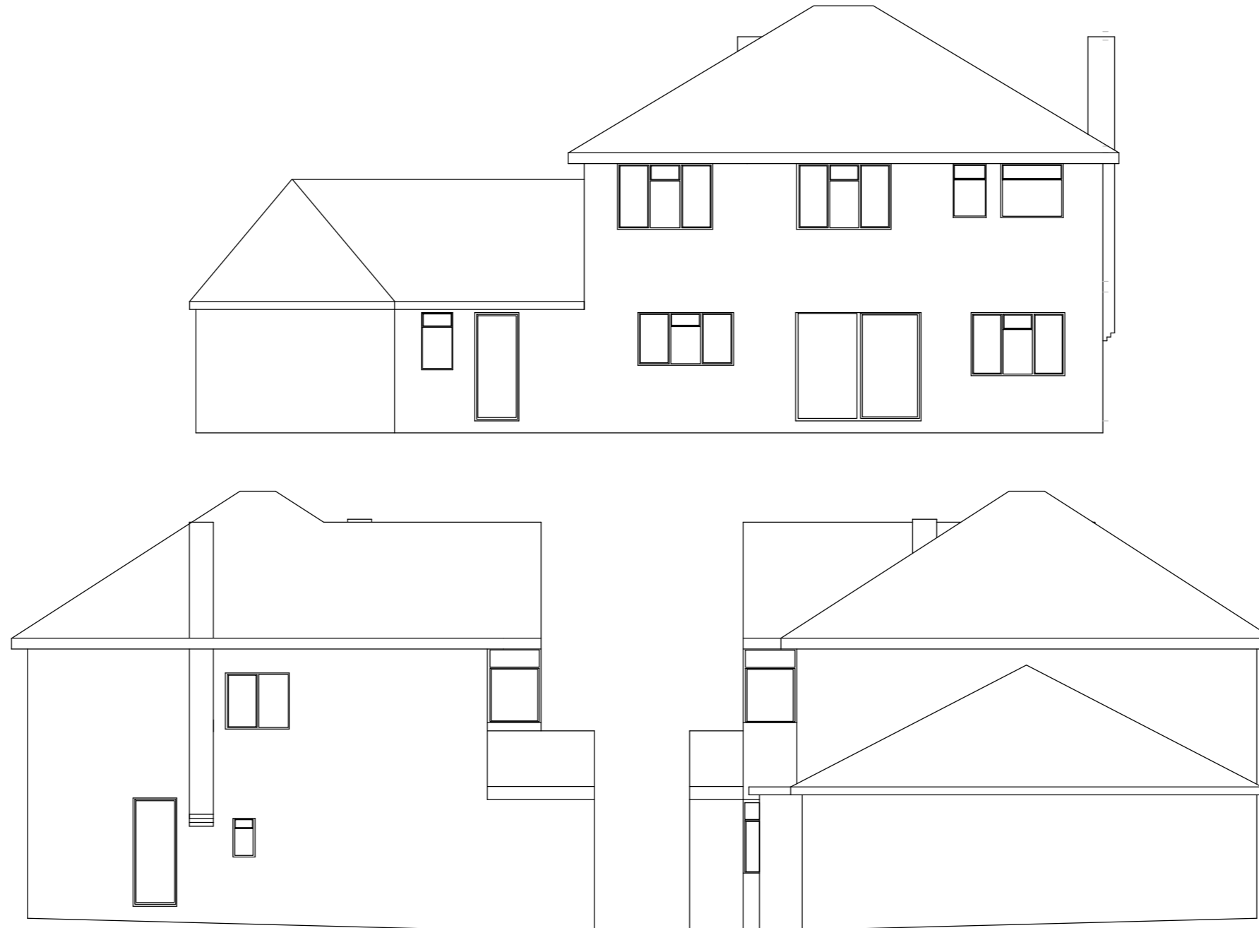
EXISTING REAR & SIDE ELEVATIONS Scale 1:100

©This drawing and the works depicted are the copyright of ASB Property Consultants LTD and may not be reproduced or amended except by written permission of ASB Property Consultants LTD