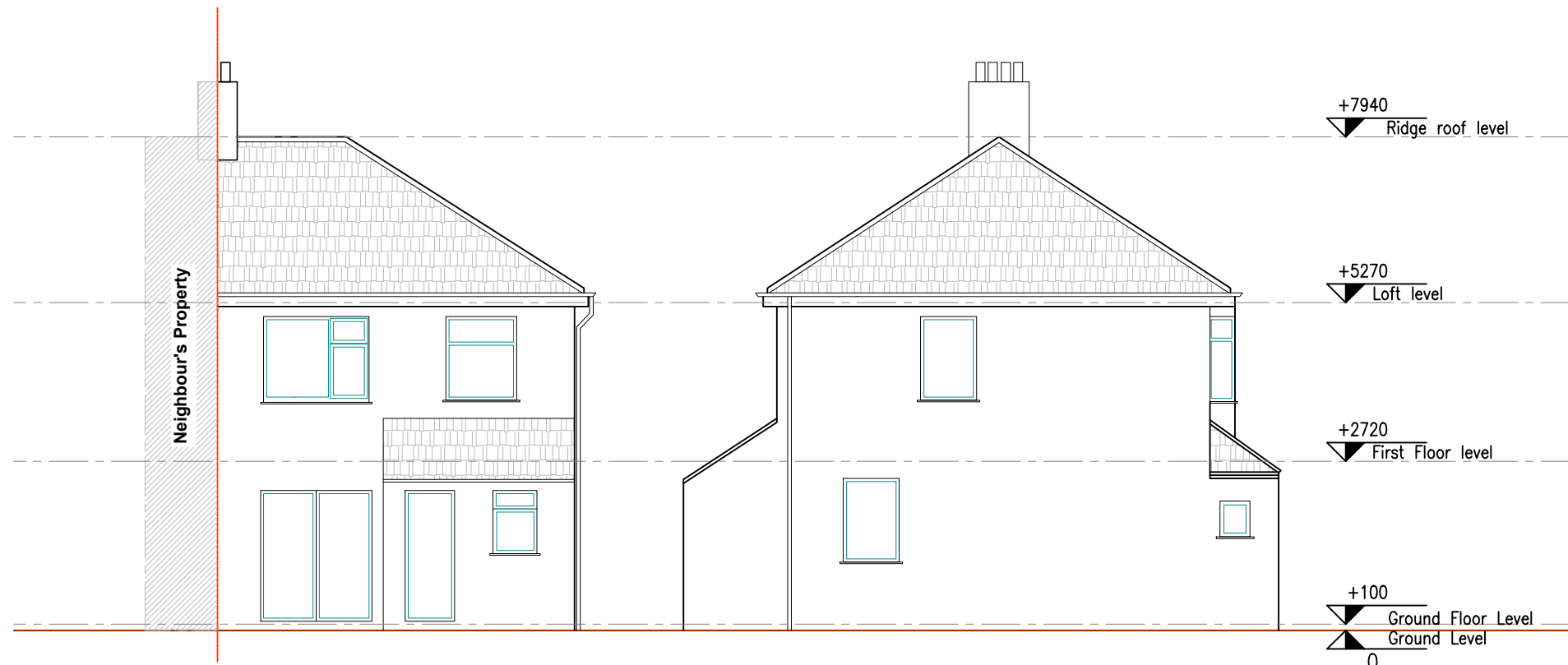
6 EXISTING REAR ELEVATION SCALE 1:100 @ A3