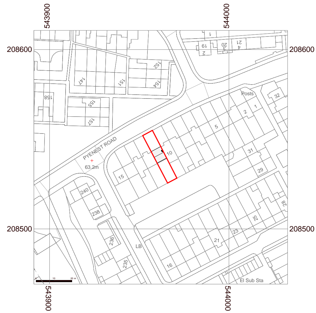
1 LOCATION PLAN 1 : 1250