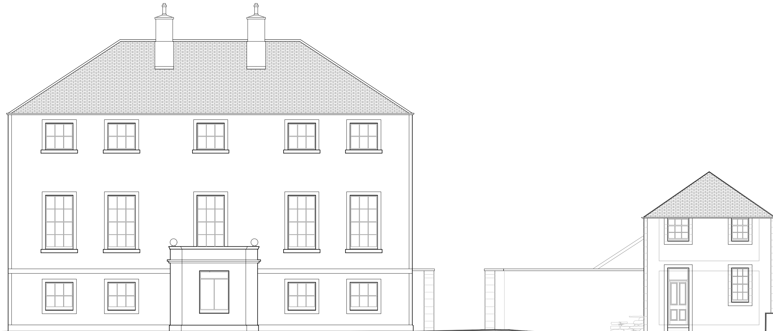
E03 Existing / Proposed South Elevation 1:100 0 1 5 10m