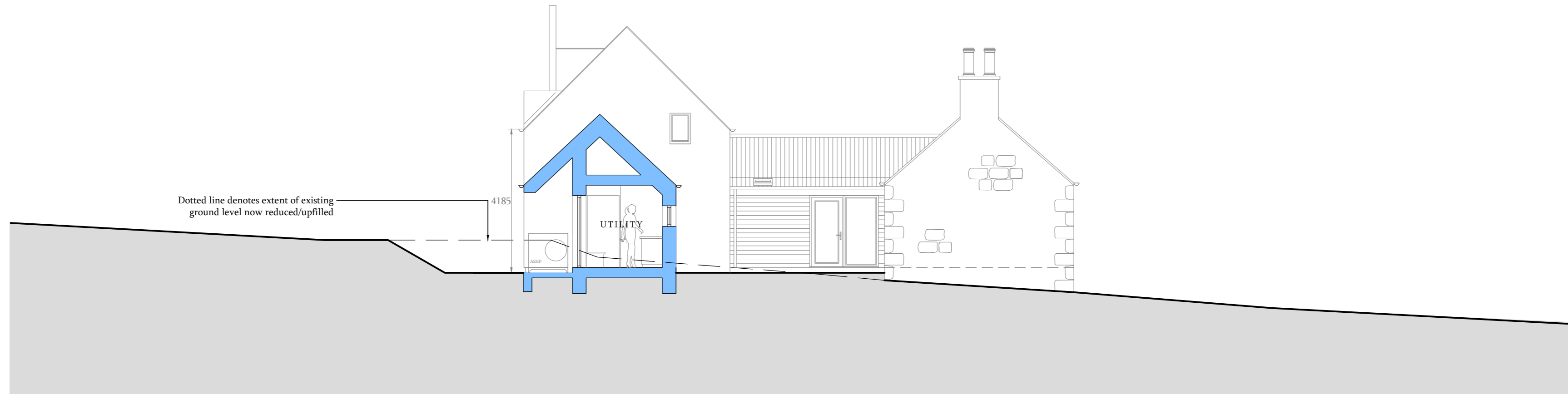
SECTION E-E (Through Utility Link) 1:100