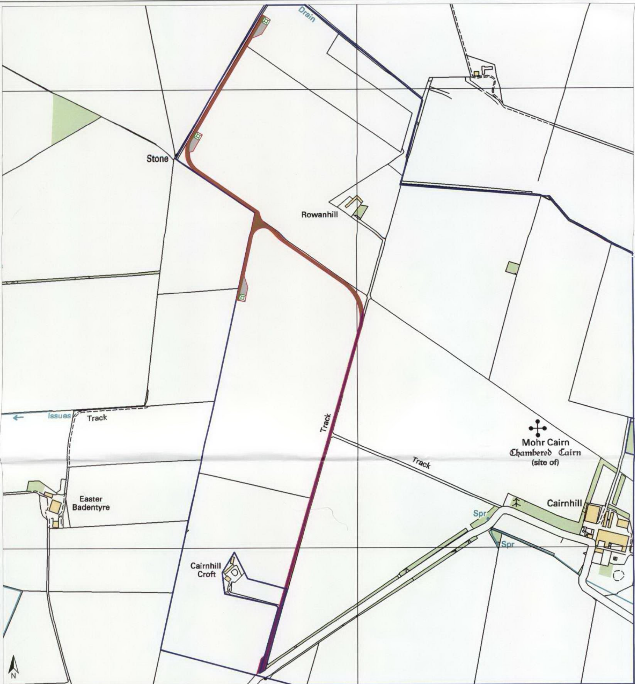
LAND OWNERSHIP AND PLANNING APPLICATION BOUNDARY. SCALE: 1:5000

Reproduced from Ordnance Survey digital map data © Crown copyright 2006. All rights reserved. License number 010003167