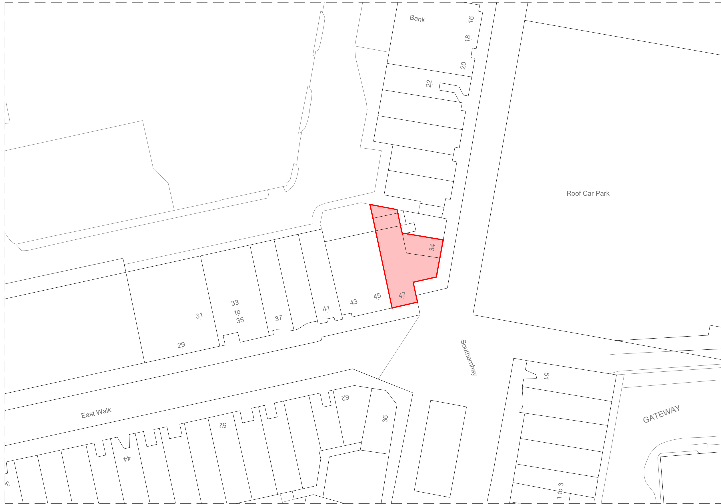
EXISTING & PROPOSED BLOCK PLAN 1:500 @ A3