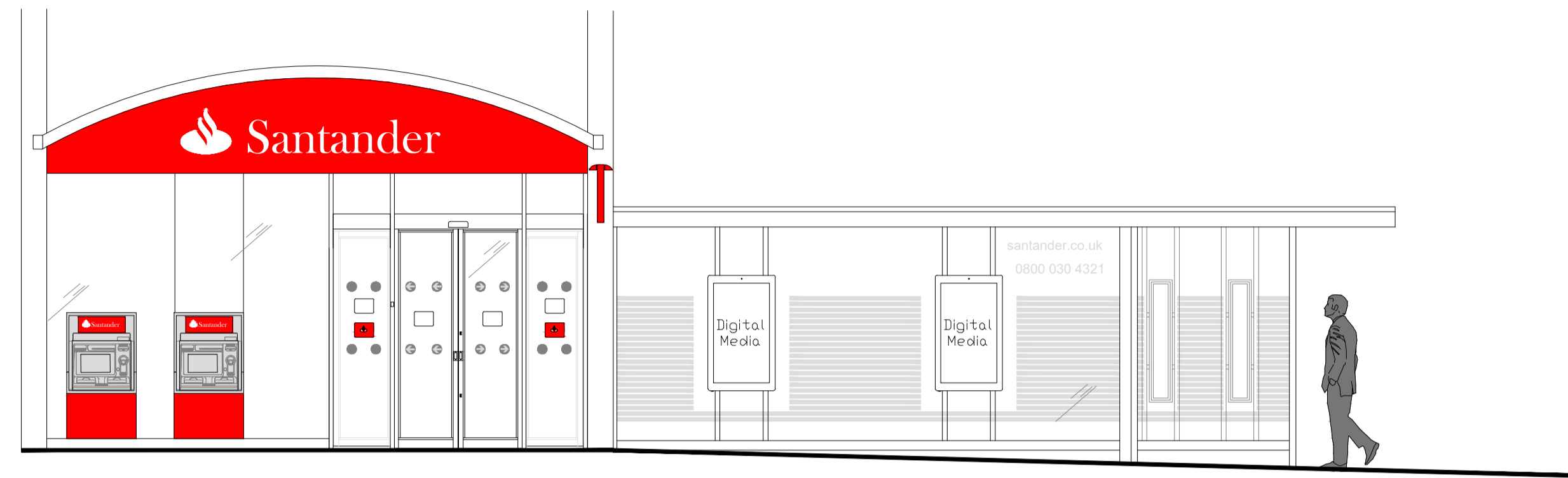
EXISTING FRONT (SOUTH) ELEVATION EAST WALK 1:50 @ A1, 1:100 @ A3