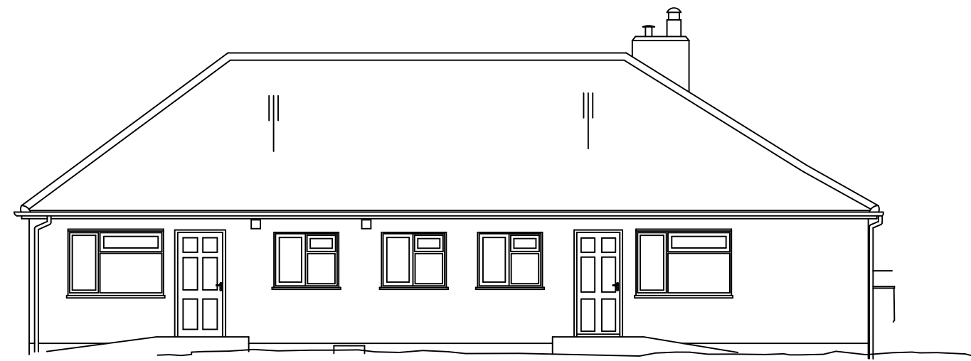
Existing West Elevation