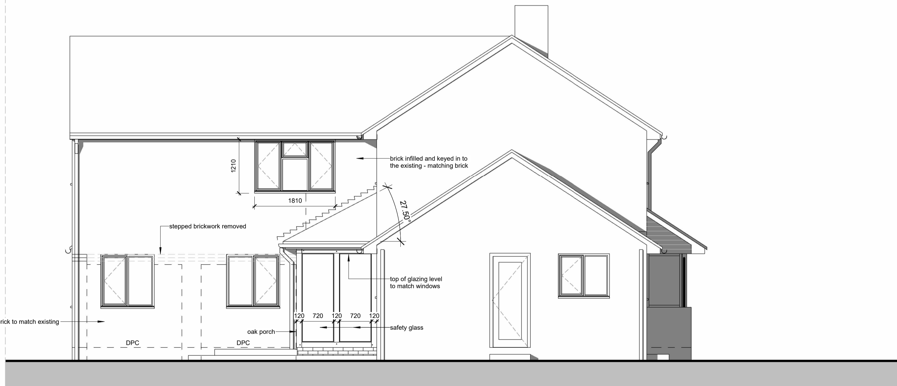
4 East Proposed 1 : 50