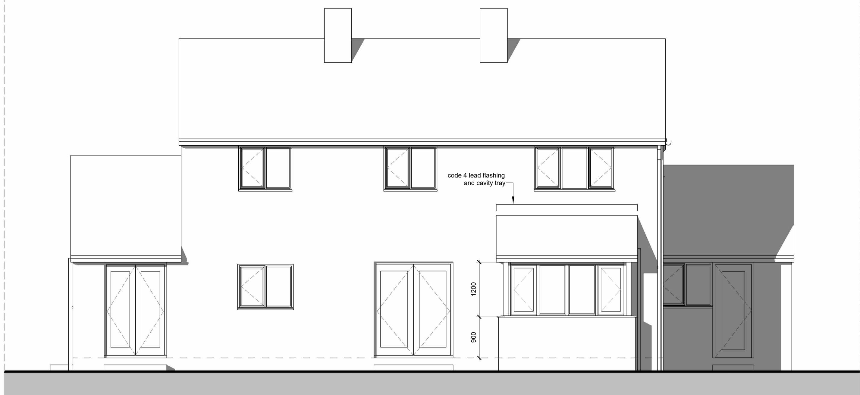
4 North Proposed 1 : 50

All work to be undertaken in accordance with any planning approvals, building regulations approvals and party wall awards, if applicable. Any work undertaken before approval is granted, before conditions are discharged or party wall agreements issued, is at your own risk. All materials to be used in accordance with the manufacturer's instructions and the appropriate British Standards. Workmanship shall comply with the appropriate British Standard. Work that does not comply shall be removed and completed again at the contractor's cost. Planning application drawings must NOT be used for construction purposes. This drawing is copyright and may not be altered, traced, copied, photographed or used for any purpose other than for which it is issued without written permission from the copyright holder. The contractor shall undertake all works in accordance with the CDM Regulations, produce construction phase plans, and notify the HSE where appropriate. This applies to all projects including domestic extensions.