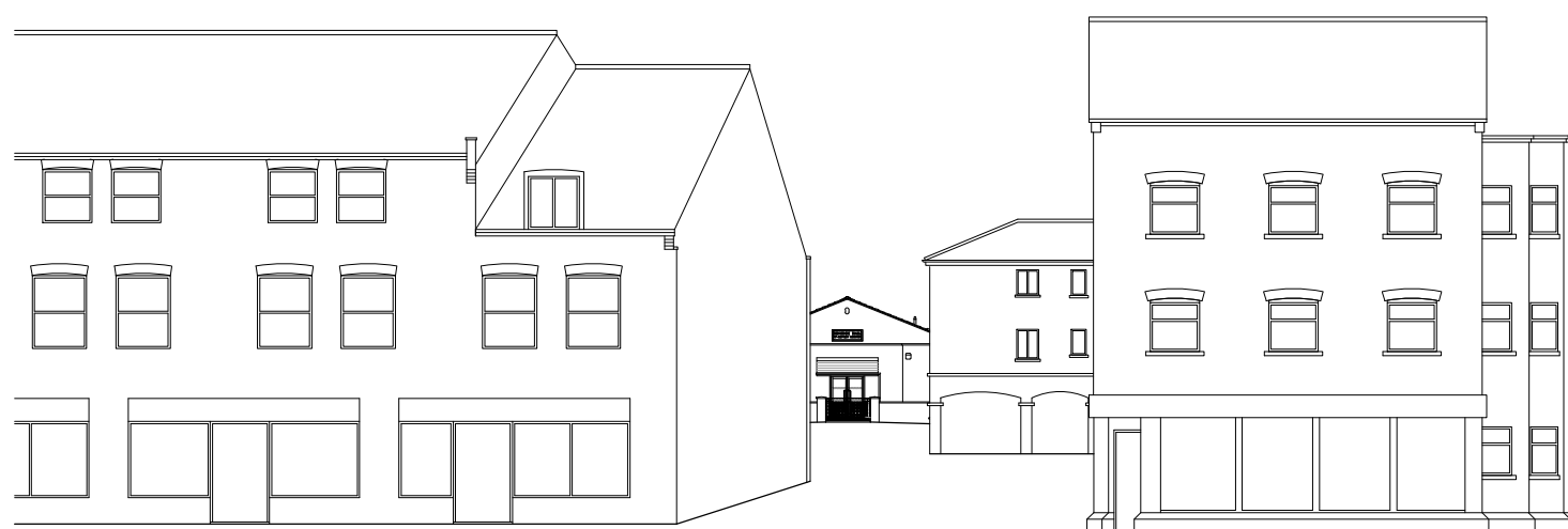
STREET ELEVATION 1:200