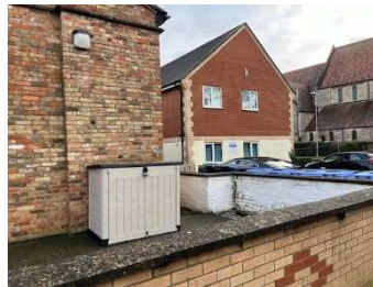
(2) View from the front of the Kingdom Hall, taken 25/1/24.