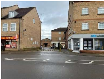
(1) View from High Street, taken 25/1/24.

The current proposals are very minor alterations to the external appearance of the existing building. These include new glazed doors on the front elevation and replacement cladding to the rear. Therefore, in view of the building's unobtrusive location, being set behind properties on the High Street and obscured by others, in addition to the minor nature of the alterations, it is considered that the impact on the character of the Conservation Area would be negligible.