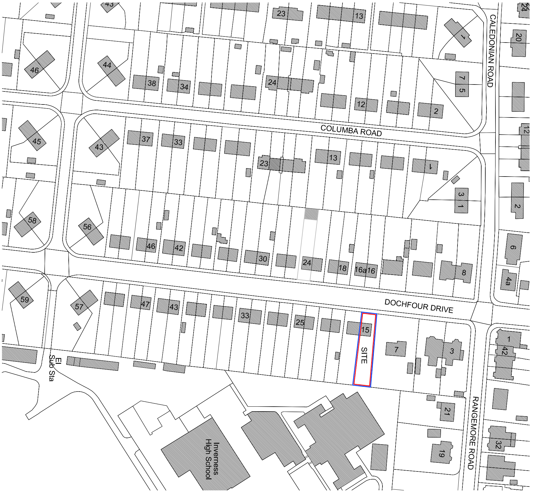
Location Plan (1:1250 scale)