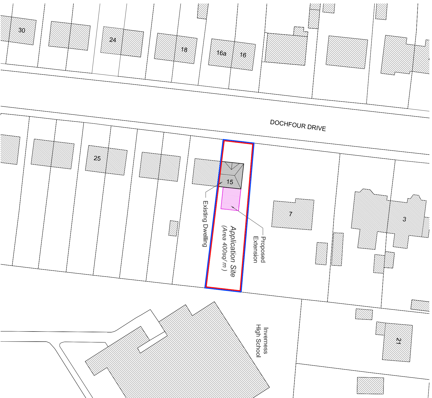
Site Plan (1:500 scale)