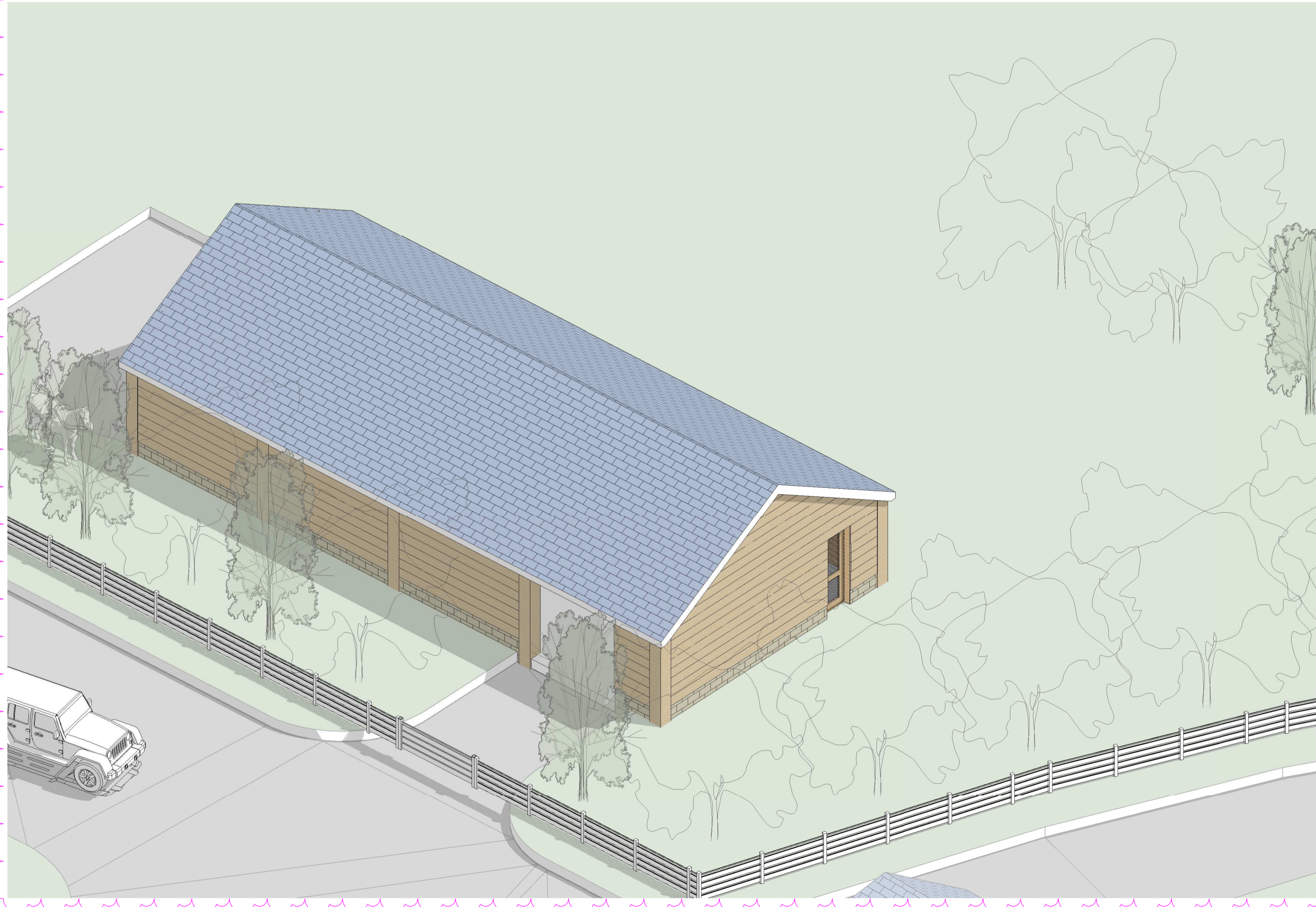
Barn Aerial View CC