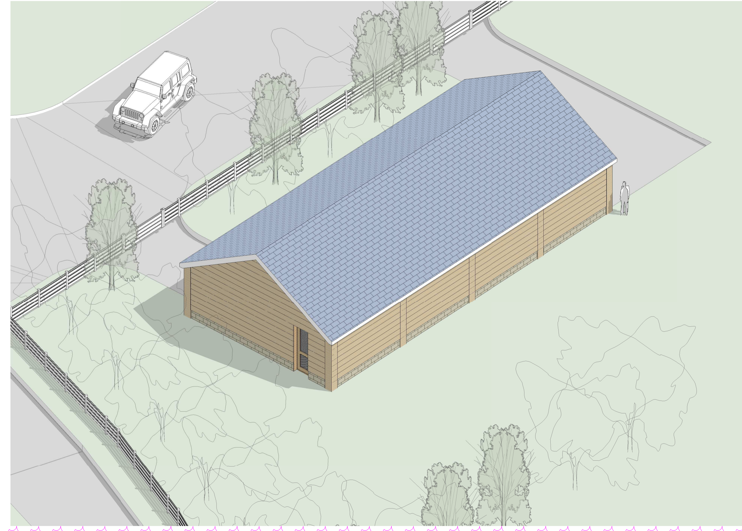
Barn Aerial View DD