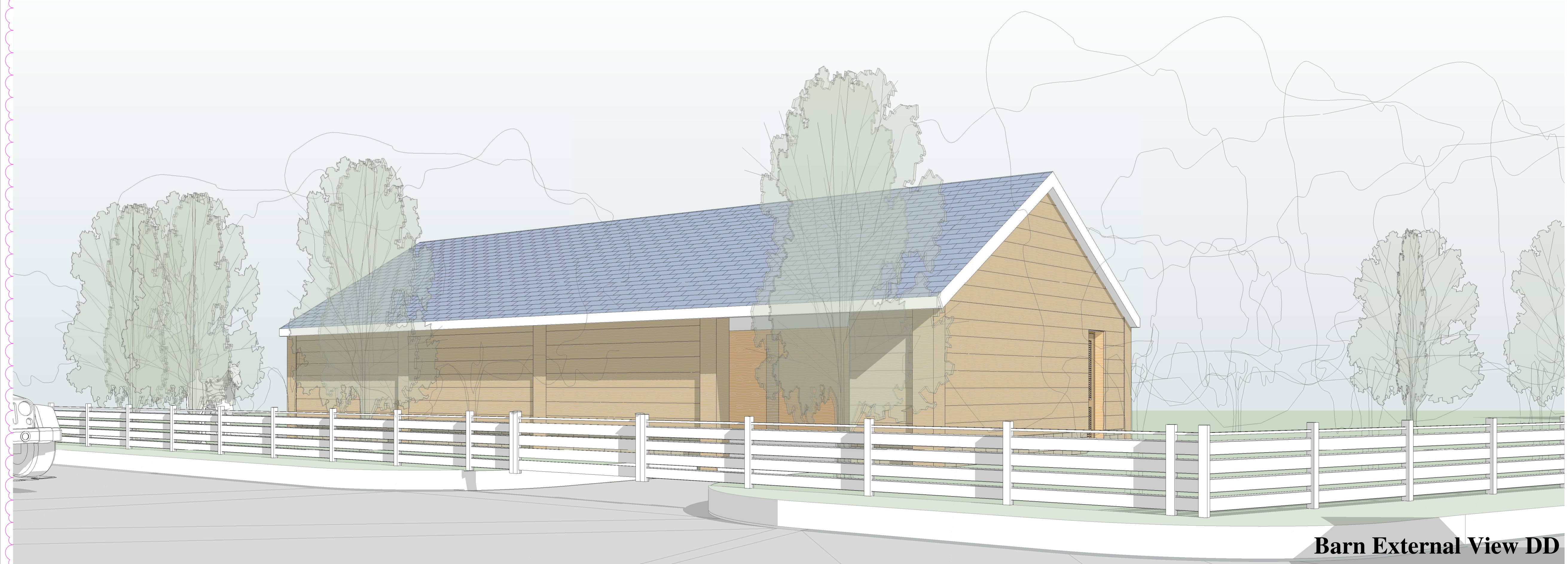
Barn External View DD

studio MAP Architecture and Project Management