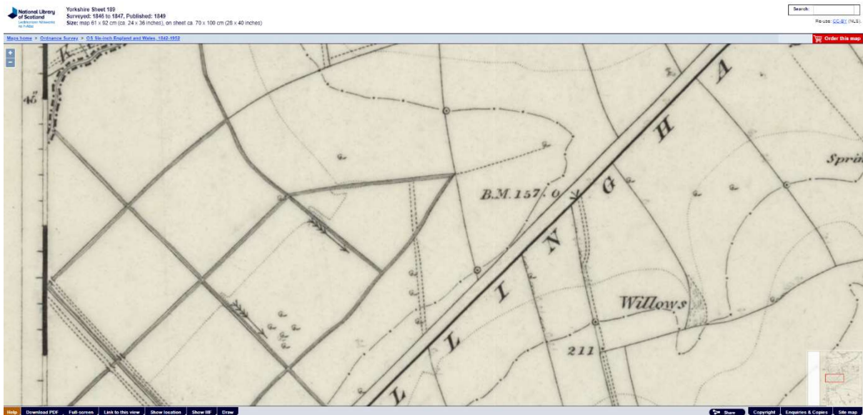
Map of 1849

Prior to 1850, the site and the wider locality was all agricultural land.