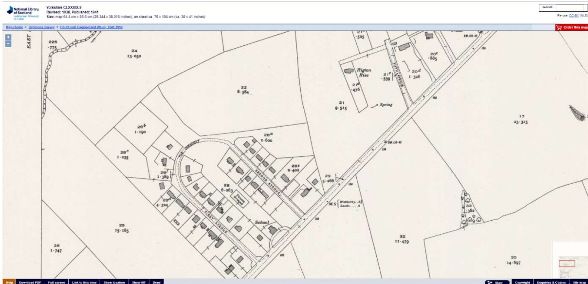
Map of 1941

Local maps surveyed from 1938 to present day show the site with the current bungalow in situ surrounded by development of First Avenue, Second Avenue and The Crescent.