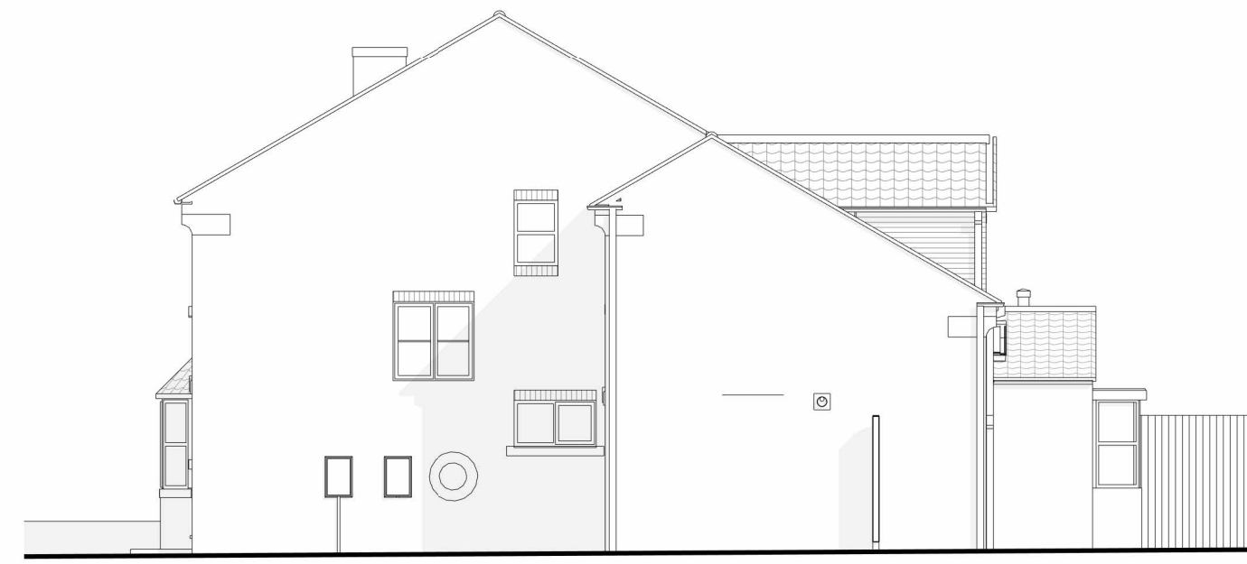
Side Elevation as Existing 1 : 100