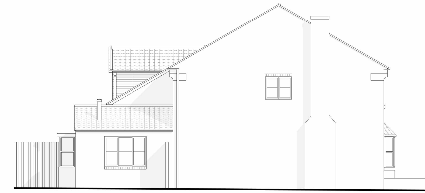
Side Elevation as Existing 1 : 100