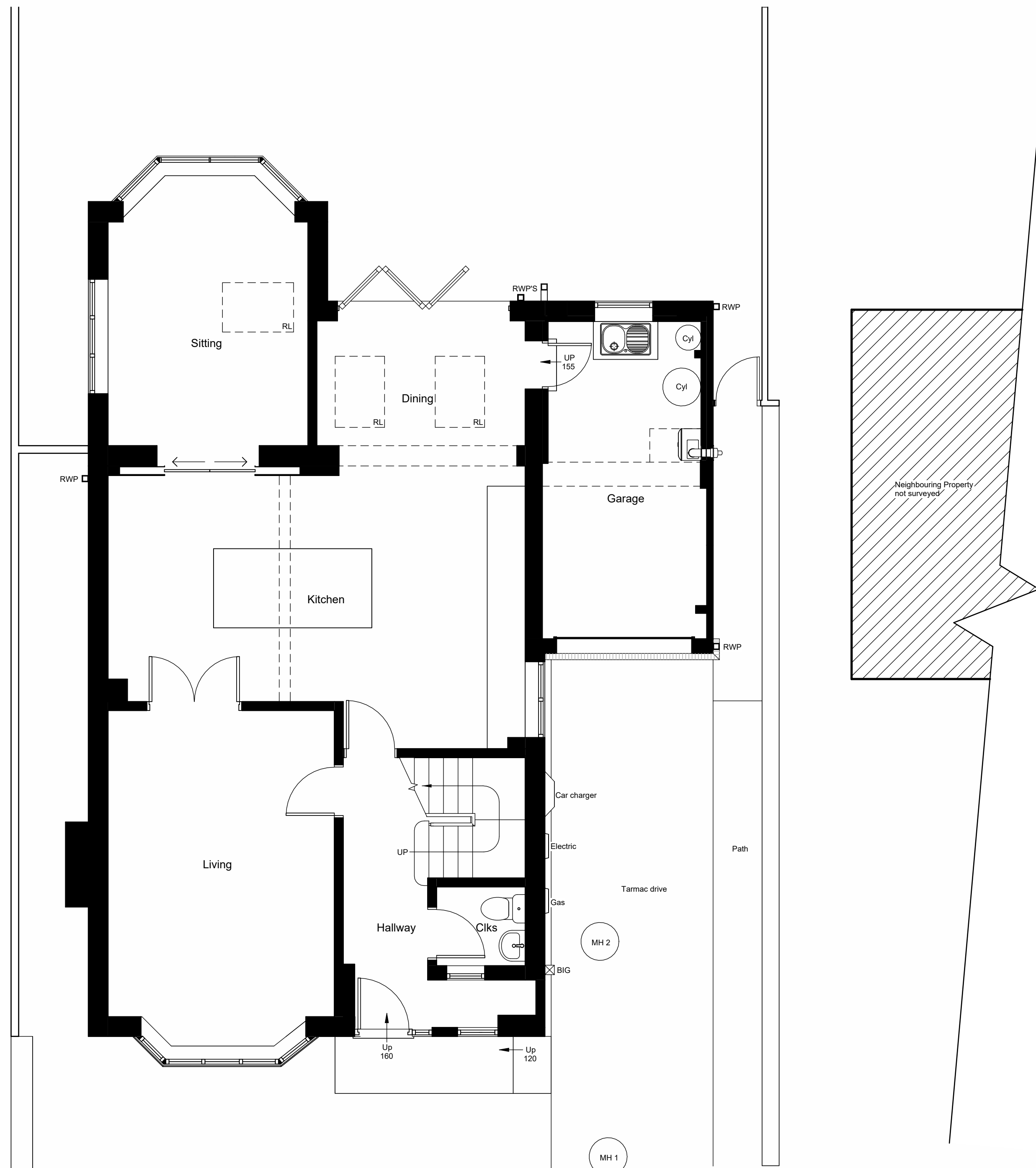
Ground Floor Plan as Existing 1 : 50