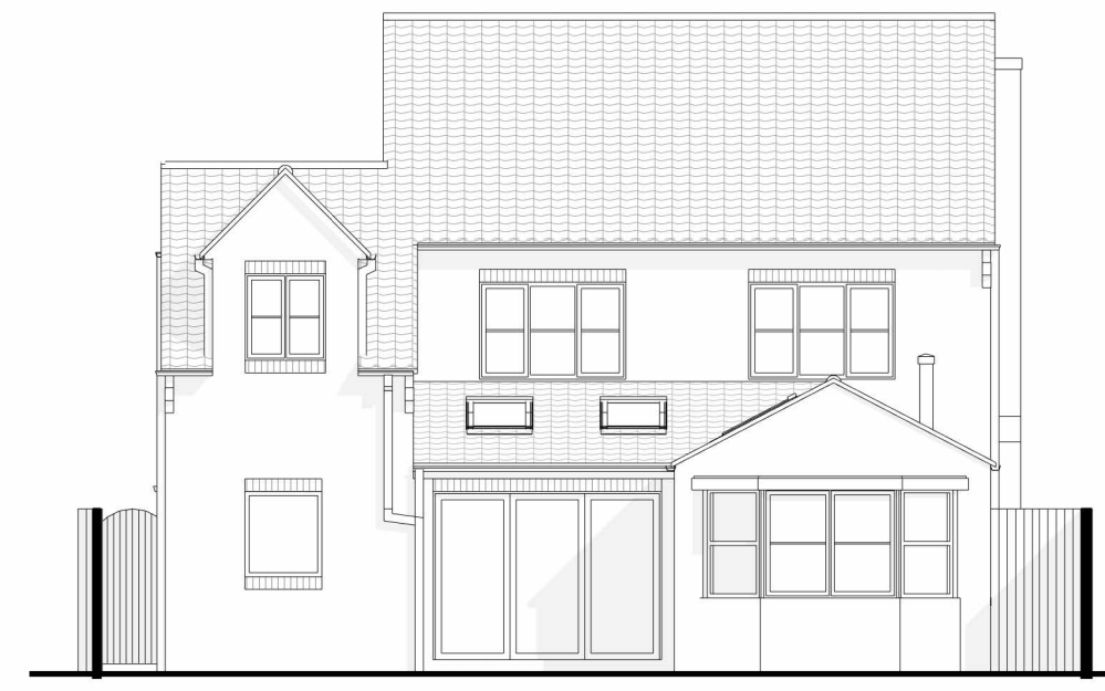
Rear Elevation as Existing 1 : 100