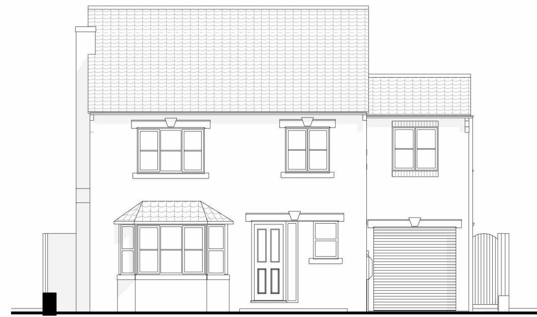
Front Elevation as Existing 1 : 100