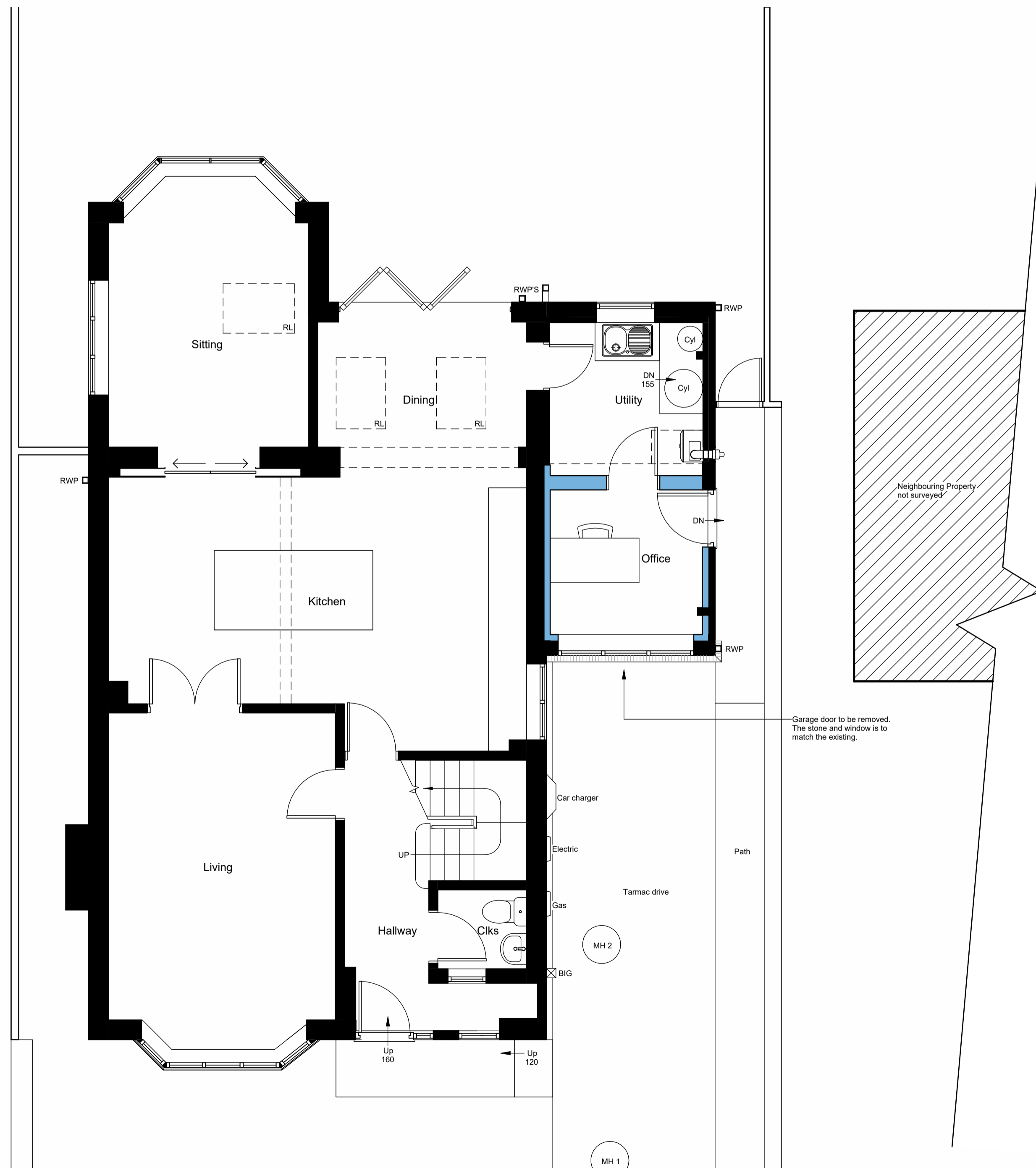
Ground Floor Plan as Proposed 1 : 50